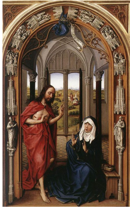
Fig. 20: Rogier van der Weyden, Miraflorales Altarpiece, 1440-1444, Gemäldegalerie, Berlin

in her house, which also frames the adjacent scenes of the Nativity and Crucifixion. Later versions of the theme are less site-specific, in keeping with the Golden Legend ; one example is Titian's Christ Appearing to His Mother of 1554 (Santa Maria Assunta, Medole). 70