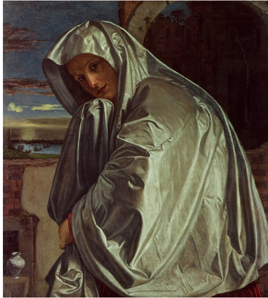
Fig. 1: Giovanni Gerolamo Savoldo, Mary Magdalene , ca. 1527-ca. 1540, National Gallery, London

upper body are almost completely enveloped by a satiny maphorion. 5 It covers a richly textured crimson dress and, behind her, an arcuated brick wall in ruins effectively isolates the figure from the background of the painting.