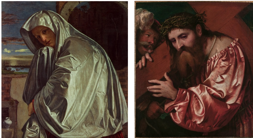
Fig. 17 (left): Giovanni Gerolamo Savoldo, Mary Magdalene , ca. 1527-ca. 1540, National Gallery, London

The half-length figural types seen in the panel by Paolo Veneziano (Fig. 15) continued to be inventively transformed by artists such as Antonello da Messina, Bellini, Giorgione, and Titian into what Sixten Ringbom calls the “dramatic close-up,” where the format of an icon is both enlarged and fused with the verism—both in physical and psychological terms—of a living person, typically Christ. 41 Pardo situates Savoldo’s Magdalene paintings firmly within this tradition. 42 Especially appealing to Mendicant patrons, this artistic development prolongs the late medieval preoccupation with the corporeal appearance of Christ and the Virgin. 43 In the late fifteenth century artists and their patrons further encouraged empathetic mourning by introducing a narrative dimension to complement the half-length figures, who were depicted as turning to confront the viewer. 44 Savoldo adopted this formula by reinventing the Byzantine Lamenting Virgin for his female Magdalenes to achieve a compelling iconic pathos. Paul Joannides has suggested that Savoldo’s Magdalene (perhaps the version in London: Fig. 17) may have been hung by the patron or owner in a manner reminiscent of the images that functioned as models for such a hypothetical diptych; the Averoldi family commissioned Christ the Cross-bearer of 1542 (Brera, Milan) from Romanino of Brescia, whose material luxury competes with that of Savoldo’s veiled women (Fig. 18). 45