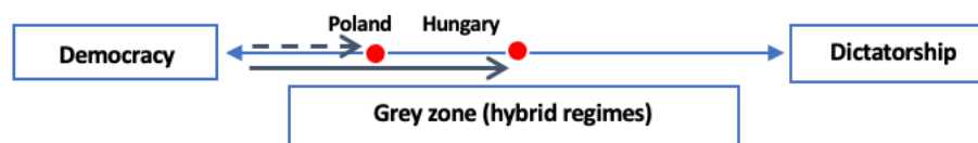
Figure 1. Kaczyński’s Poland and Orbán’s Hungary on the democracy–dictatorship axis. The Polish trajectory is a dashed line, the Hungarian a continuous line.

This presentation implies that Poland and Hungary are walking the same path—as if the same process is taking place in both countries, and the de-democratizing difference between them is only quantitative. But going from a single-level to a dual-level approach, and considering the presence or lack of patronal transformation, it can be seen that democratic backsliding in the two regimes indeed follows qualitatively different trajectories (figure 2).