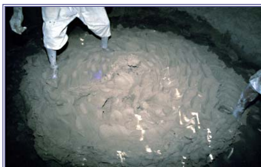
Figure 4. Trampling marl clay at Deir el-Gharbi, near Ballas, Upper Egypt. A second preparation stage at Deir el-Gharbi; elsewhere possibly the only stage.

order to produce a workable clay (figs. 3 and 4; Nicholson and Patterson 1985; 1989). Veins of calcite frequently occur in marl deposits, and any pieces of calcite that are included in the clay mixture are carefully removed by those treading the clay, since to