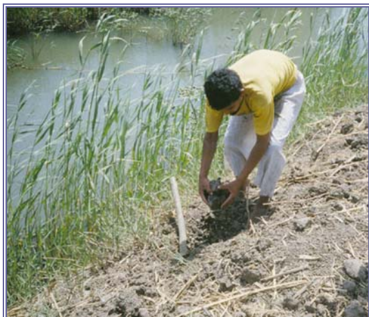
Figure 1. Collecting Nile silt clay from the bank of an irrigation canal near Deir Mawas, Middle Egypt.

two main types of clay for indigenous Egyptian ceramics: Nile silt and marl (Bourriau 1981; Nordström and Bourriau 1993: 149 - 187). As the name suggests, Nile silt clay comes from the Nile River. Strictly speaking it is a misnomer, since to a geologist “silt” and “clay” refer to two different particle-size fractions. For the Egyptologist it is simply a convenient way of distinguishing this riverine, alluvial clay—which is rich in iron and so fires to a red color in an oxidizing atmosphere—from the marl clays. Marl clays usually contain at least 10% calcium carbonate (lime), and in field tests can be distinguished using a 10% solution of hydrochloric acid, to which they react by effervescing. Marl clays normally fire to a cream or buff surface. This surface starts to form during the drying of the vessel, when the calcium carbonate begins to effloresce on the vessel’s surface, in the same manner as the glaze in effloresced faience.