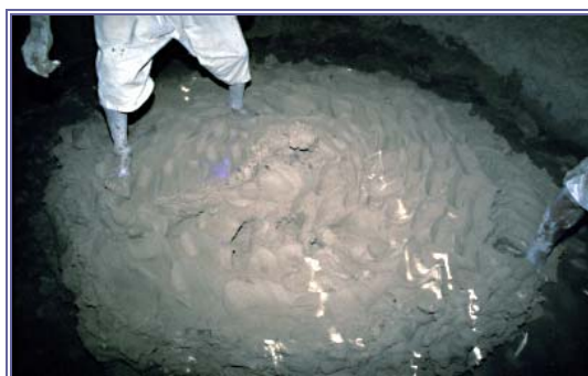
Figure 4. Trampling marl clay at Deir el-Gharbi, near Ballas, Upper Egypt. A second preparation stage at Deir el-Gharbi; elsewhere possibly the only stage.

order to produce a workable clay (figs. 3 and 4; Nicholson and Patterson 1985; 1989). Veins of calcite frequently occur in marl deposits, and any pieces of calcite that are included in the clay mixture are carefully removed by those treading the clay, since to