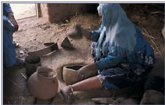
Figure 5. Making a water storage vessel ( qird ) using a paddle and anvil and a hollow for shaping. Deir Mawas, Middle Egypt.

the vessel) is incorporated. Non-radial methods treat the vessel as though it were a piece of sculpture and essentially model it without reference to a particular vertical axis. In the free-radial method the pot might be constructed by coiling or rotating intermittently as the clay is drawn up to form the walls. Centered-radial techniques involve a rotating support with a fixed central axis—the potter’s wheel. The rotation of this device at speed allows the use of centrifugal force to help in the drawing up and shaping of the vessel.