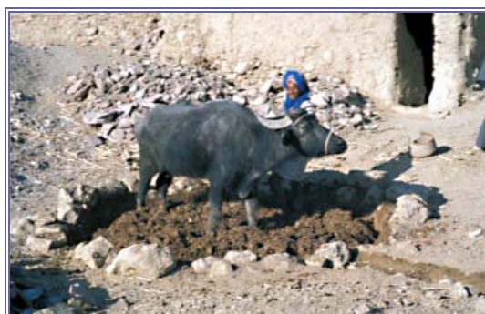
Figure 3. Trampling marl clay at Deir el-Gharbi, near Ballas, Upper Egypt. Smaller-scale production may only require human (rather than animal) trampling.