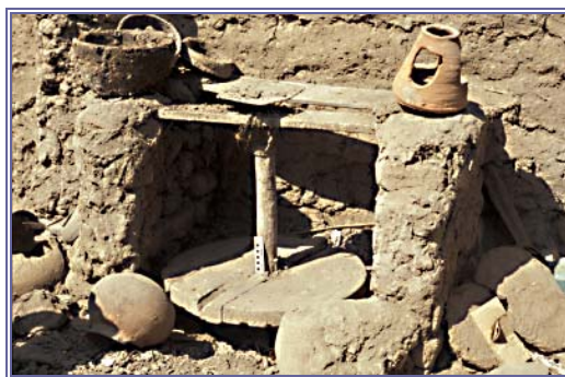
Figure 6. A typical kick-wheel. Deir Mawas, Middle Egypt.

Arnold and Bourriau (1993: 17) differentiate between types of wheel and whether they are rotated by hand or “kicked” by movement of the foot (fig. 6). All wheels, however, are capable of producing pottery using centrifugal force, as has been demonstrated in experiments by Powell (1995) (fig. 7). The first known wheels appear in the Old Kingdom (Dynasty 5 or 6), with the kick-wheel perhaps appearing in the Late Period.