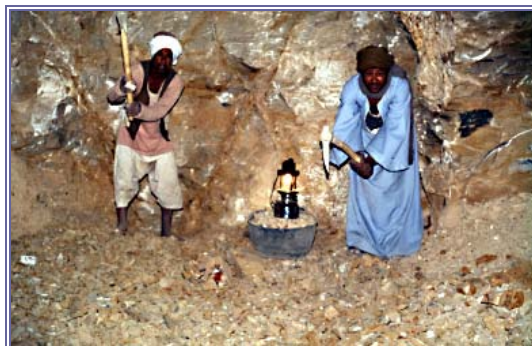
Figure 2. Miners excavating marl clay at Deir el-Gharbi, near Ballas, Upper Egypt.

Whereas Nile clays can be obtained virtually anywhere along the course of the Nile (fig. 1) and are therefore widely available, the occurrence of marl clays is much more limited, being confined to a few main localities, notably around the Qena area of Upper Egypt (see Arnold 1981). In these localities the marl is quarried or mined as though it were a rock (fig. 2) and generally arrives at the workshop as solid blocks that must be broken up, soaked, and trampled in