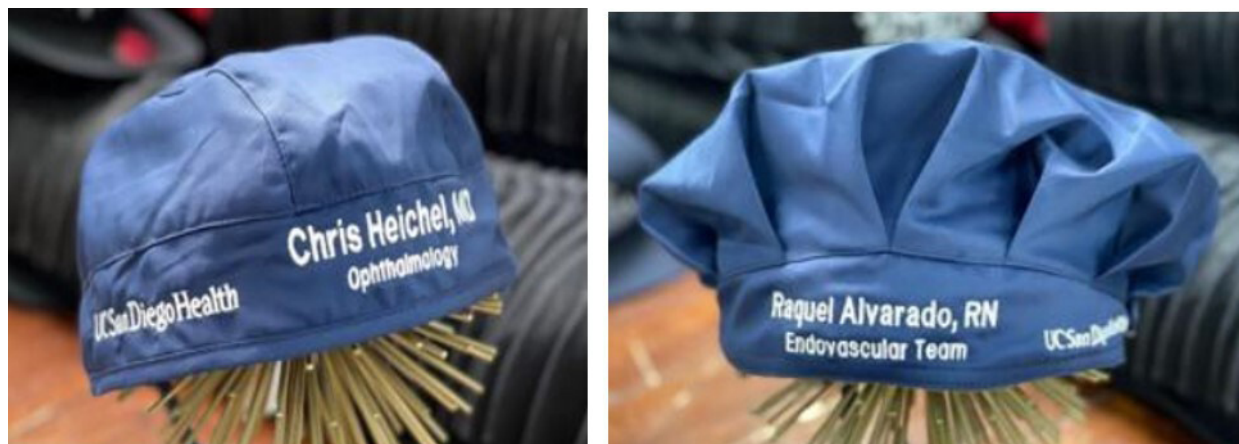
Figure 1 Example picture of labelled surgical cap (left) and bouffant (right).

As part of an initiative to improve interdisciplinary team communication, personalised embroidered surgical caps or bouffants labelled with preferred name, degree, and department or position were offered to all team members within perioperative services. The surgical caps were available to any employee or student at the study institution who helped provide surgical care to our patients, including but not limited to surgery and anaesthesia teams (attending, residents, fellows and advanced practitioners), nursing staff, technicians, environmental services, schedulers, central and sterile processing, pathology, radiology, other ancillary services, as well as non-clinical team members (management, analysts, administration). The two surgical cap styles shown in figure 1 were designed with and purchased from a local third-party vendor (Precision Threads Embroidery, Chula Vista, California, USA). To obtain a personalised surgical cap, a perioperative team member would complete a brief online order submission form with their preferred