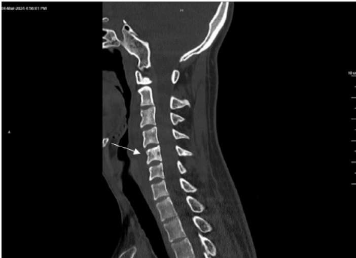
Image 2. Sagittal computed tomography of the cervical spine without contrast demonstrating lucent expansile lesion involving the fifth cervical vertebral body (arrow), consistent with Ewing sarcoma.