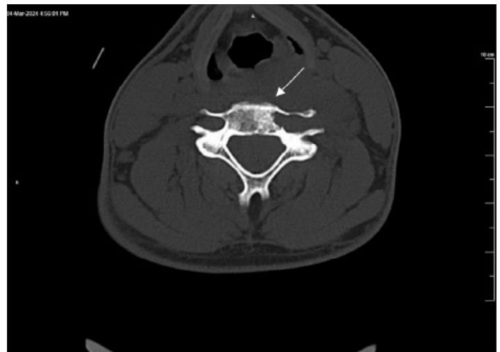
Image 1. Transverse computed tomography of the cervical spine without contrast demonstrating lucent expansile lesion involving the fifth cervical vertebral body and transverse process (arrow), consistent with Ewing sarcoma.

This case exemplifies the necessity of broadening the differential diagnosis to include spinal etiologies in patients presenting with focal neurological deficits.