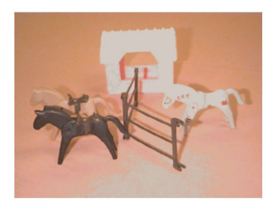
Figure 1: Sample not-all scenario from Musolino and Lidz (2006): 2 of 3 horses succeed at jumping over the fence.

Children's ability to access the inverse scope interpretation has been shown to be sensitive to manipulations of experimental context. The methodology typically used to assess children's scope disambiguation is the Truth Value Judgment Task (TVJT; Crain & McKee, 1985). In the basic TVJT, children are presented with a background story about the actors—for example, horses engaging in some activities. After this background story, children watch as the horses attempt to complete an action, such as jump over a fence. The critical not-all result state meant to prompt the inverse scope interpretation is illustrated in Figure 1, where the white horse fails to jump over the fence.