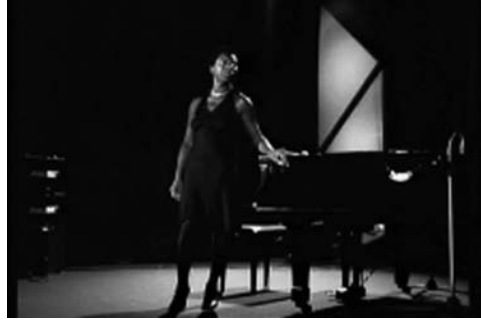
Nina Simone strikes a contrasting pose.