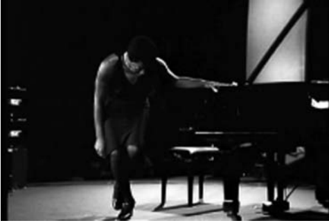
Nina Simone curtsies for her audience at Casino Stage.