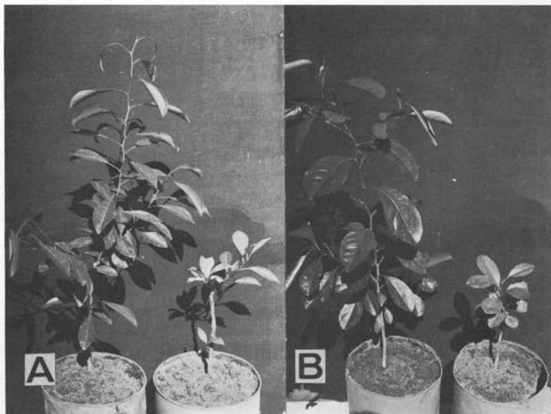
FIGURE 2. Seedlings inoculated with leaf-mottling virus and healthy controls. A. Szinkom mandarin. B. Florida Rough lemon.

In a third experiment, bud inoculum was taken from 2-year-old field-grown seedlings of calamandarin and Eureka lemon that showed severe yellow mottling of leaves. Budwood from 4 diseased seedlings of calamandarin and 2 of Eureka were used to inoculate Key lime and sweet orange seedlings. Only 1 of the diseased seedlings was found to be carry-