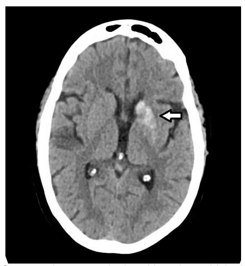
Image 1. Computed tomography head imaging, which shows hyperintensity (arrow) in left caudate nucleus concerning for potential hemorrhagic stroke.

Nonketotic hyperglycemia-induced hemichorea (or hemiballismus) is a rare condition seen with uncontrolled diabetes. It is commonly initially misdiagnosed as a seizure due to the uncontrolled choreiform movement of one extremity.<sup>1</sup>