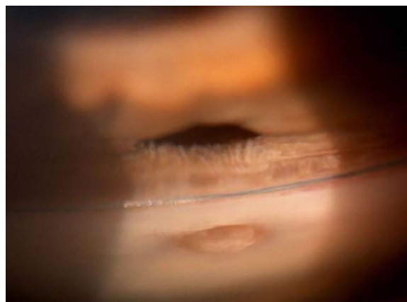
Fig. 1 Gonioscopic image of a canaloplasty performed after trabeculectomy: Prolene suture in place

Careful evaluation of patient's clinical characteristics is always mandatory when selecting a surgical procedure. Patients with moderate/high IOP and without advanced visual field and/or optic disc damage probably benefit more from CP as extremely low IOPs are not required. The absence of a filtration bleb and its non-penetrating nature make CP particularly attractive for patients at high risk of infections or choroidal bleeding, with enhanced wound healing or with complications from a previous TRAB in the contralateral eye [41]. Finally, young