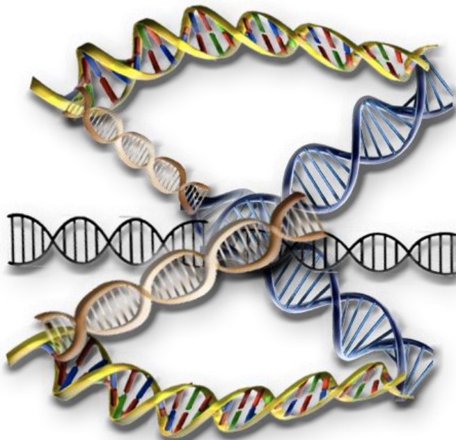
Figure 1 - Decolonial Storytelling DNA Helixes

the fact that DNAs hold the blueprint for how living organisms are built. Similarly, a decolonial voice holds the blueprint for how ambiguous narratives are written. Serros' books do not supply the readers with any answers. Instead, she encourages them to step outside of their own knowledge base to enter unorthodox spaces that can lead to new understandings about ideological terms, such as Chicana falsa and Chicana role model. Figure 1 depicts decolonial storytelling DNA helixes. Serros' narratives overlap on the helixes because they layer, bend, shift, and transform through their interconnections with each other as well as other authors' works. Stories exist on multiple strands at one time and are not constrained by time or space. Instead, they are in a constant conversation with other narratives that are located on the various helixes. These points of contact are key because they allow a decolonized voice to emerge. The focus is less on who's story is the best and more on how each narrative elucidates new understanding for all who encounter it.