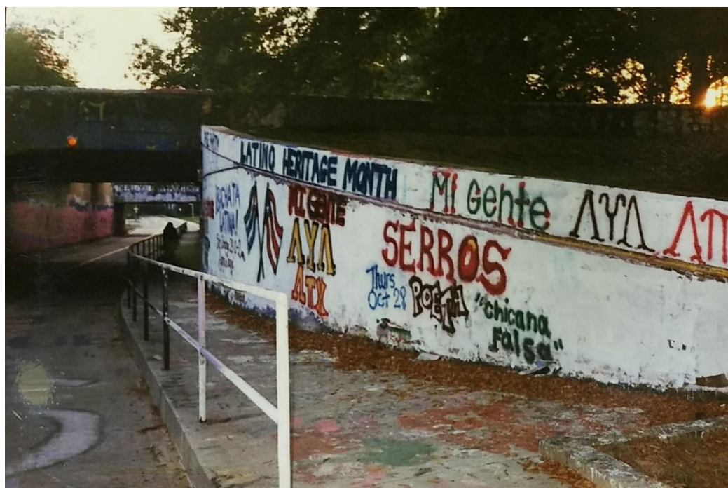
Figure 14 - Serros' Name and Book Title in Graffiti

example of a masculine body that is not respected as a human being. Flaco is a troubled male youth who must prove that he is a man: “Flaco held his manhood / steady. Aimed it at / a city block / pissing boosted Krylon / citrus yellow / cherry red / black” (21). At first, it seems like he is pissing on the side of a building. He holds a stolen can of Krylon, spray paint, that represents his “manhood.” It sprays on the wall like pee. The gang colors, yellow, red, and black, bleed on the side of the building. He participates in the tagging because he wants to join a crew: “His defiant stand / earned him / a loyal crew / customized baseball cap / TV tabloid exposé / and a toe tag” (21). Flaco’s stand was enough to get him initiated into a crew. They have his loyalty. Community, a sense of belonging, is important because it provides the reassurance that someone will be there to support him. Plus, he gets a customized cap that represents his hood. Unfortunately, loyalty does not keep him alive. “Tag Banger’s Last Can” translates to his last stand, the end of his life. The poem concludes with a toe tag; Flaco’s involvement leads to his death.