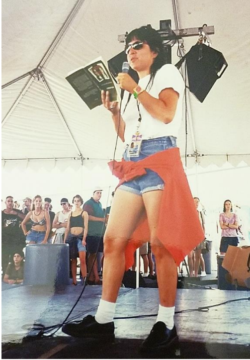
Figure 3 - Reading at Lollapalooza