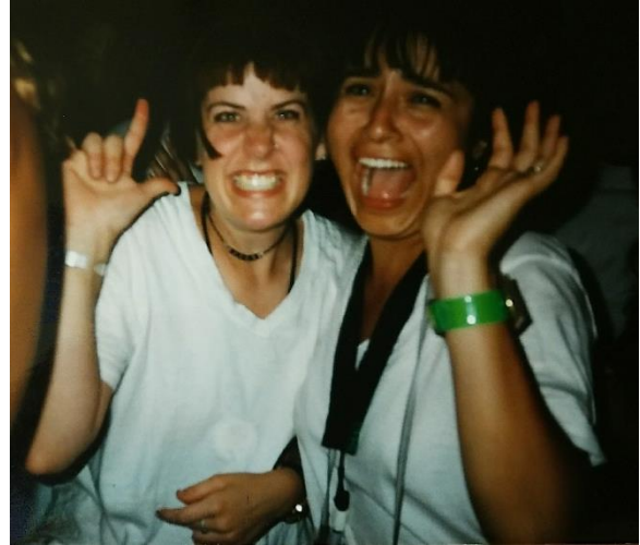
Figure 5 - Taxco de Alarcón