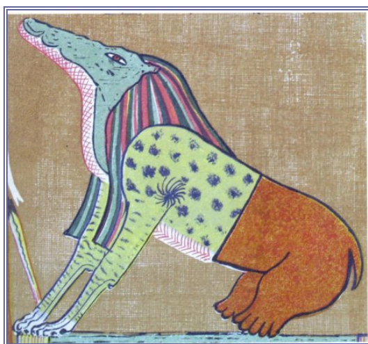
Figure 4. Ammut, “the devourer of the dead”, from Spell 125 of the Book of the Dead .

Egyptological interpretation of demons as minor deities derives from these protective figures, which are often depicted with an animal head on an anthropomorphic or mummified body and holding knives or other weapons in their hands.