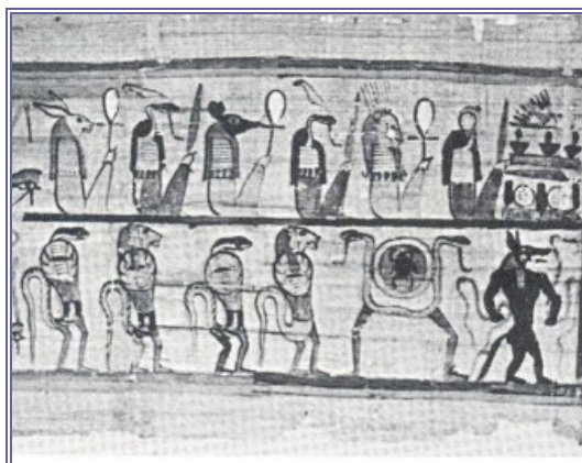
Figure 3. Guardian demons from a Guide of the Netherworld