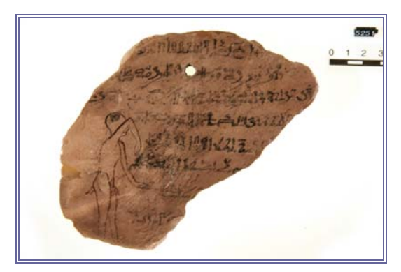
Figure 1. Sehaqeq, the headache demon. Ostracon Leipzig, Ägyptisches Museum Georg Steindorff. Inv.-No. 5152.