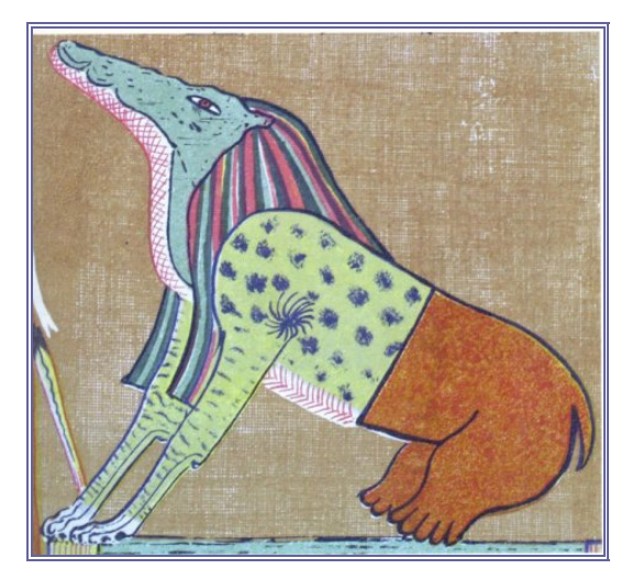
Figure 4. Ammut, "the devourer of the dead", from Spell 125 of the Book of the Dead .

Egyptological interpretation of demons as minor deities derives from these protective figures, which are often depicted with an animal head on an anthropomorphic or mummified body and holding knives or other weapons in their hands.