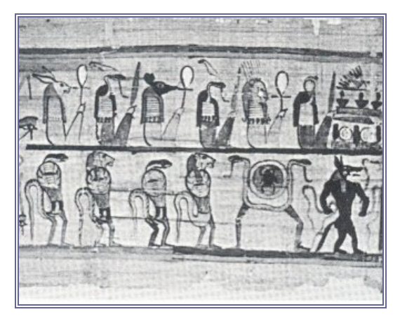
Figure 3. Guardian demons from a Guide of the Netherworld