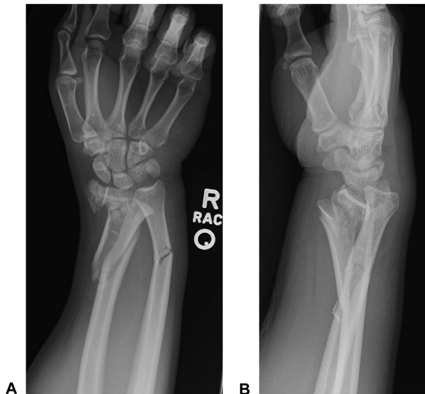
Figure 2. Example of wrist and forearm injury sustained from fall from border wall. A Anterior-posterior and B lateral x-rays demonstrate an example of an upper-extremity injury with distal fracture of both the radius and the ulna that can be sustained from a fall from significant height.

* This describes details of upper-extremity injuries sustained before and after border wall height increase. Superficial lacerations were defined as lacerations involving only skin and subcutaneous tissues requiring repair. Deep lacerations were defined as lacerations involving deeper structures, including muscle and/or neurovascular structures, that required repair. A P value less than 0.05 is considered statistically significant.