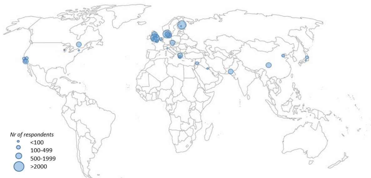
Figure 1 Geographic distribution of survey projects reviewed

An overview of the survey projects selected for review is shown in Figures 1 and 2.