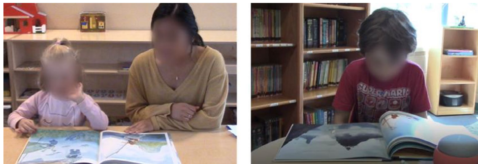
FIGURE 1 Study procedure of Human-dialogic reading (DR) condition (left) and Agent-DR condition (right). Note: A child participant in the Human DR condition (left) and another participant in the Agent DR condition (right; note the agent device in the lower right corner)