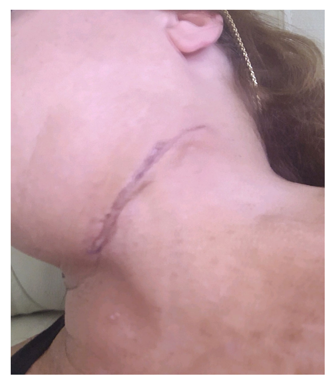
FIGURE 2 Healing incision following removal of the drain and dressing at home on postoperative day 7. The neck was closed with deep absorbable suture and skin glue and this photo obtained from the telehealth encounter shows no evidence of seroma or surgical site infection [Color figure can be viewed at wileyonlinelibrary.com]

A 57-year-old female was seen in early March 2020 with a 2-month history of an enlarging 2 cm submandibular mass. She was otherwise asymptomatic and the remainder of her physical examination including flexible laryngoscopy was unremarkable. An ultrasound-guided fine needle biopsy demonstrated malignant adenoid cystic carcinoma and her staging CT had no evidence of cervical lymphadenopathy or pulmonary metastasis. In early April 2020, she underwent an uncomplicated ipsilateral neck dissection, levels I-III. Perioperative antibiotics were not administered for this clean site surgery. The neck was closed over a quarter-inch Penrose drain which was brought out through the posterior aspect of the incision. The remainder of the incision was closed with deep absorbable sutures and skin glue. The Penrose drain was sutured to gauze that was fashioned into a dressing with additional gauze and transparent film dressing (Tegaderm) in such a way that the drain would be pulled as the patient removed her dressing at home in several days. The inferior portion of the dressing was not sealed, and the patient was instructed to change the overlying gauze as needed for