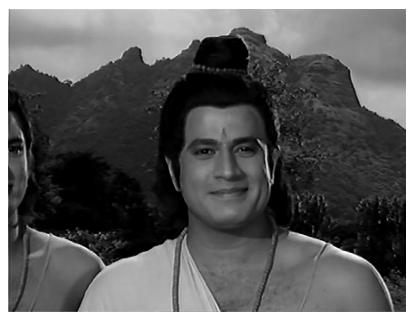
Figure 2. Rama gracing the screen with his mystical smile in Ramanand Sagar's TV Ramayana (1989).

calculation but only on the unreal grounds of dream kitsch. They give again a possible life to the revolutionary energies that once inhabited outmoded forms. Like Benjamin's surrealists, they "bring the immense forces of 'atmosphere' concealed in these [mournful] things to the point of explosion. What form do you suppose a life would take that was determined at a decisive moment precisely by the street song last on everyone's lips?"<sup>68</sup> What form of life by the tableau last seen by everyone reflecting how, though empty, "they are in some sort sufficient to themselves"?<sup>69</sup> And so on for all the other senses and capacities.