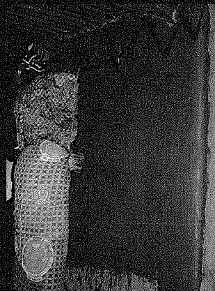
2. Polishing ground layer.