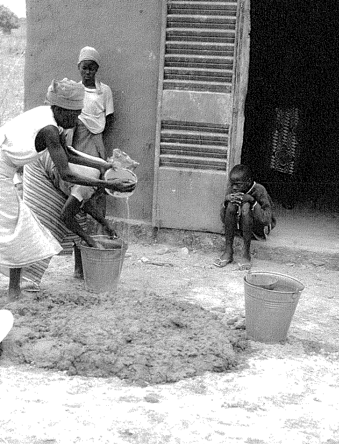
1. Laterite is mixed with cow dung and water to create the ground layer.