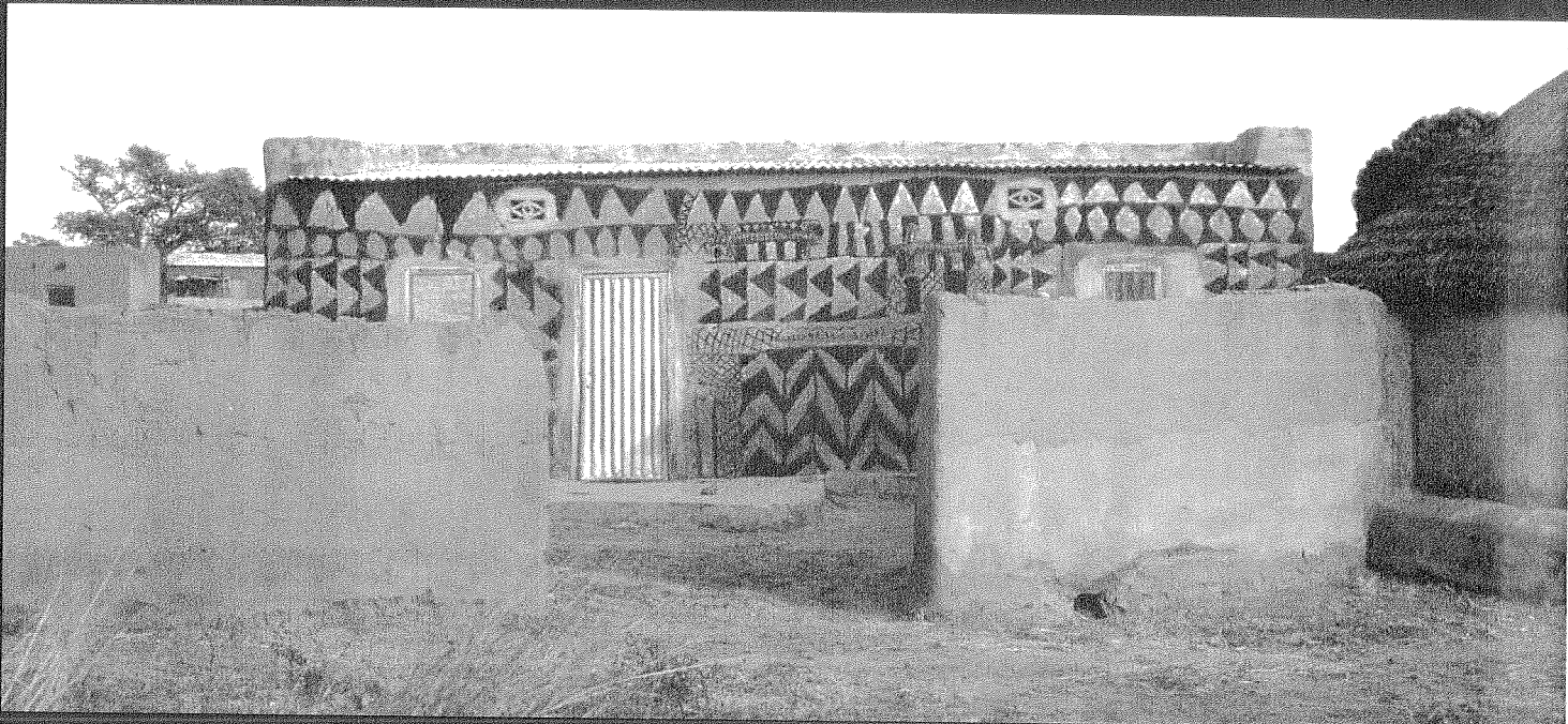
A finished house.