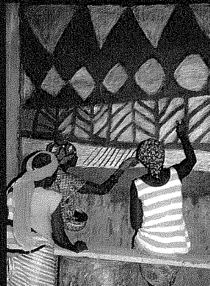
4. Filling in white.