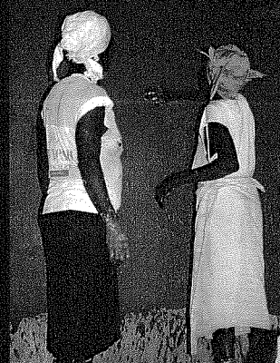
3. Drawing with black—broken calabash pattern.