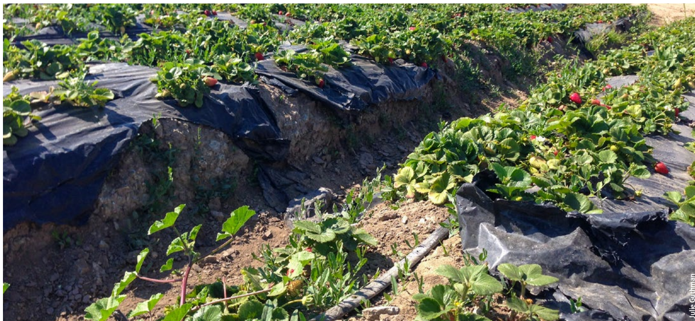
Methyl bromide has been used by growers since the 1970s to control soil pathogens, weeds and nematodes. Above, weeds and pathogen wilt in a Santa Cruz County field that was not treated with methyl bromide.

OEHHA and the DPR panel provided extensive comments on the draft document by the end of 2009. Both expressed skepticism about the chemical's safety and in their risk assessment reports concluded that the application of methyl iodide in field fumigation could result in significant health risks for workers and the general population (DPR 2010c; Lim and Nu-May 2010). Nevertheless, in April