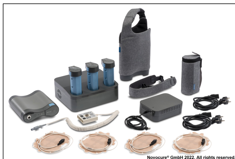
FIGURE 1 The portable NovoTTF-200A System delivers TTFields using four skin-placed arrays.

EF-11 was a prospective, randomized controlled clinical study evaluating the efficacy and safety of TTFields monotherapy versus physician's choice of best standard of care (BSC) in adult patients with rGBM. TTFields monotherapy showed clinical benefit comparable to chemotherapy in patients with rGBM. Median survival with TTFields therapy versus BSC was 6.6 versus 6.0 months (hazard ratio [HR], 0.86 [95%] confidence interval (CI): 0.66–1.12]; p = 0.27 ), 1-year survival rate was 20% versus 20%, and progression-free survival (PFS) rates at 6 months were 21.4% and 15.1% ( p = 0.13 ), respectively. TTFields therapy-related adverse events (AEs) included localized mild and moderate skin rash beneath the arrays. Patients in the group treated with TTFields therapy experienced fewer treatment-related AEs and systemic AEs than those in the BSC group. Quality of life (QoL) favored the use of TTFields therapy over BSC in the cognitive and emotional function domains, with no significant differences between TTFields therapy and BSC in the global health and social functioning domains. Furthermore, symptom scale analysis regarding treatment-associated AEs – appetite loss, diarrhea,