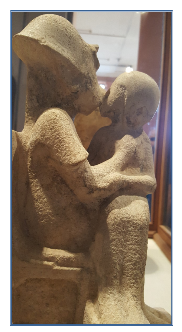
Figure 1. An exceptional kiss from the Amarna Period between Akhenaten and daughter. Tenderness flows from the daughter's hand, resting on her father's arm, which in turn touches her shoulder, and the sculptor has, unusually, fused their lips together.

It is well established that Egyptian art represents its subjects in a unique way; Brunner-Traut's (1986) term "aspective" pervades the literature, although its meaning continues to be redefined (e.g., Assmann 2005: 28; Verbovsek 2015: 146-147). Nyord (2013: 144) suggests that the Egyptian artist was attempting to show "the completed object," which accounts for parts or views of an object being shown that could not be seen together in reality, while other aspects were simply not