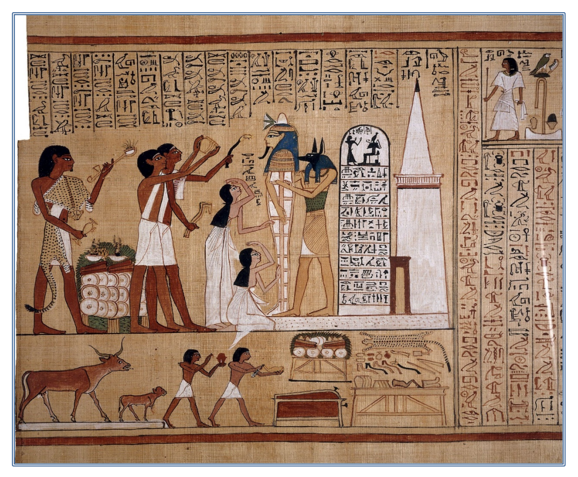
Figure 3. 19th Dynasty vignette from the papyrus of Hunefer. The mourning women's gestures convey their emotion, but their faces remain impassive. Compare, in the register below, the distressed cow protesting at the mutilation of her calf.