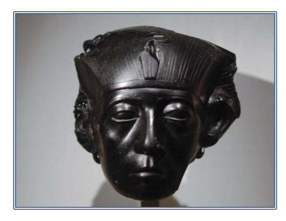
Figure 2. Obsidian head of Senusret III (Middle Kingdom), showing his typically hooded, heavily shadowed eyes and downturned mouth.

in a scene, the animals seeming to act as exemplars of emotion: for example, distress represented by animals with open mouths (Evans 2015: 1665; McDonald fc.), or fearsomeness embodied in the lion accompanying the king in New Kingdom battle scenes (although some would interpret the lion simply as a "pet," e.g., Gaballa 1976: 122). Animals used in this way should be seen as distinct from those used to represent body parts in hieroglyphs, where they are exemplars of physical features (for the possible origins of this, see Anselin 2001).