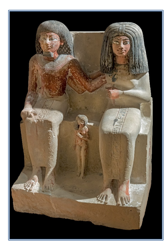
Figure 4. 18th Dynasty statue of a man and his wife, each with an arm around the other. Their daughter is sheltered beneath.

If we do not expect to see emotion reflected in the face, we might look for it in posture and gesture (Dominicus 1994; Baines 2017); for example, in the embrace of couples in statue groups, we see either an arm around shoulders, or a hand on an arm (fig. 4; compare P. Harris 500, Group B: "... your arm rests on my arm, for my love has surrounded you": Fox 1985: 22). Even if the activities of the minor figures in tomb reliefs and paintings contrast with the passivity of the tomb owner himself, the gestures of the former speak of practicality and not emotion (Robins 2008: 20). Exceptions to this rule can be found in the Middle and especially New Kingdoms (particularly among those of low status), but again the emotional content of a scene or interaction between persons derives from stance and pose rather than facial expression. Thus in the tomb of Menna we see aggression between two servant girls, one of whom pulls the other's hair, while the other girl grabs her attacker's wrist. This is