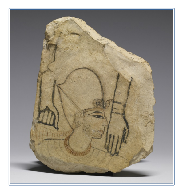
Figure 6. Ostracon showing a king with stubble on his face as a sign of mourning.

Ramesside Period was the depiction of stubble on the face of pharaohs to depict their grief for a deceased predecessor (fig. 6; Czerkwiński 2014; Staehelin 1975).