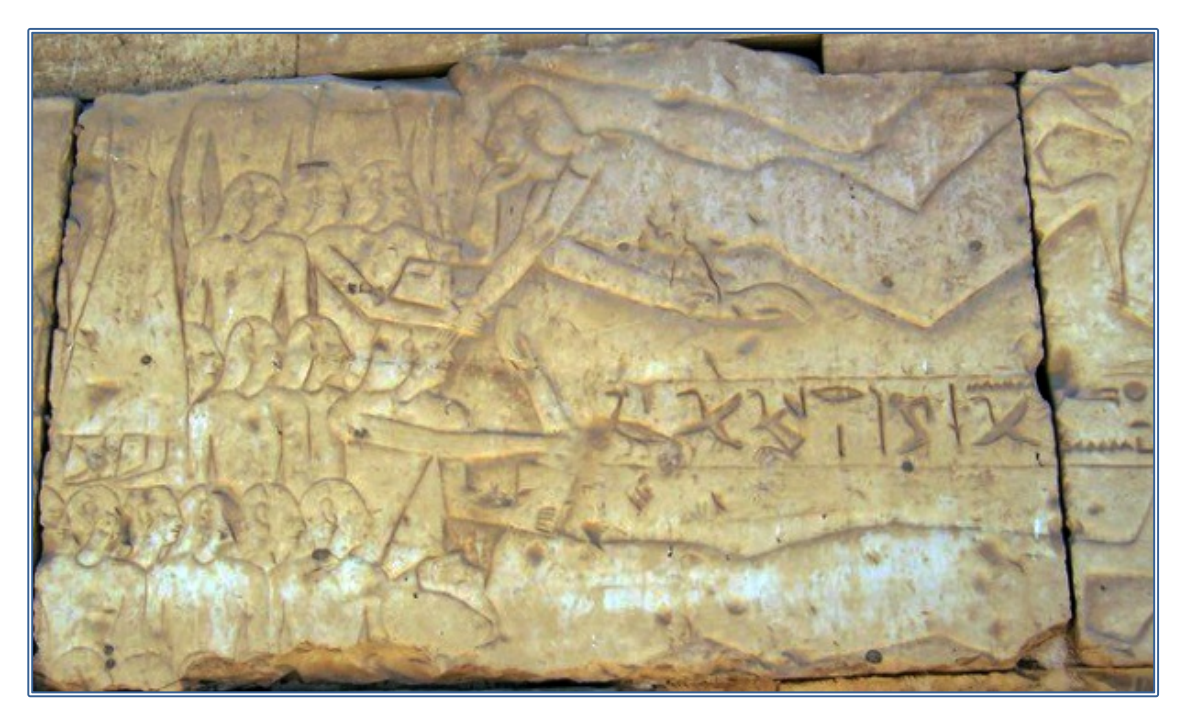
Figure 5. 19th Dynasty scene from the Battle of Qadesh, showing the drowning of Hittite leaders. Their bodies are contorted, while tender gestures from smaller figures on the river banks invest their deaths with emotion.

shape of a slightly off-balance scribe (Russmann 2001: 152). His expression is controlled, but his body betrays signs of drinking and eating to excess—perhaps the artist's attempt to capture the hedonism of those excesses for magical purposes.