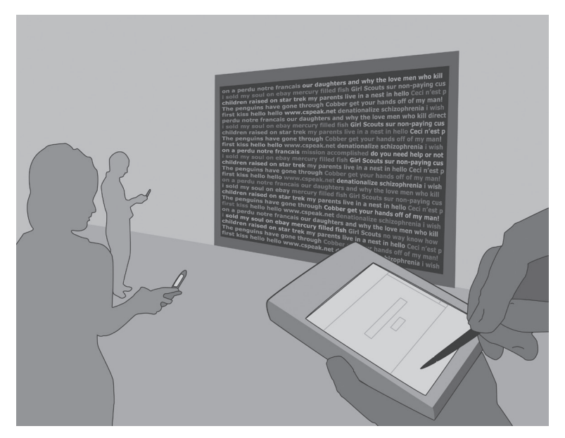
FIGURE 1.1. Cityspeak, illustration. Courtesy of Jason Lewis, Obx Labs.

scholarship on the material specificities of hardware and software, an expansive and transmedial concept of public messaging allows me to articulate TXTual practice as such and identify the aspects that are relatively stable across a diverse range of events and installations. Such a critical move need not be subject to the charge of "screen essentialism" as Matthew Kirschenbaum outlines it in his refutation of a "medial ideology," which is our seduction by flickering signifiers and blindness to inscriptive acts (see Kirschenbaum 2008, esp. 31-45). That one type of project should require only a portable projector and mobile phone, another should be programmed for a virtual environment from which it cannot be exported, and another should involve extensive preliminary work on site, along with the negotiation of civic and commercial strictures, does matter, but matter—the material, whether framed in terms of inscription, apparatus, platform, or technological object—cannot alone account for their significance. To think exclusively in terms of material specificities is to lose sight of the intermedial and social systems in which the object or thing