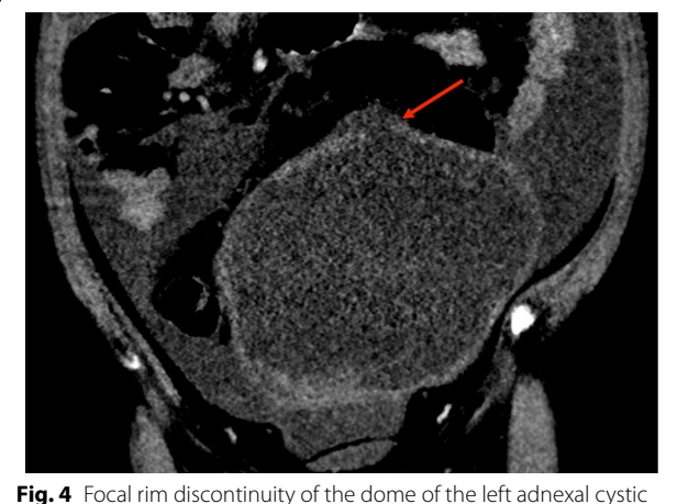
rig. 4 Focal rim discontinuity of the dome of the left adnexal cystic mass (red arrow)