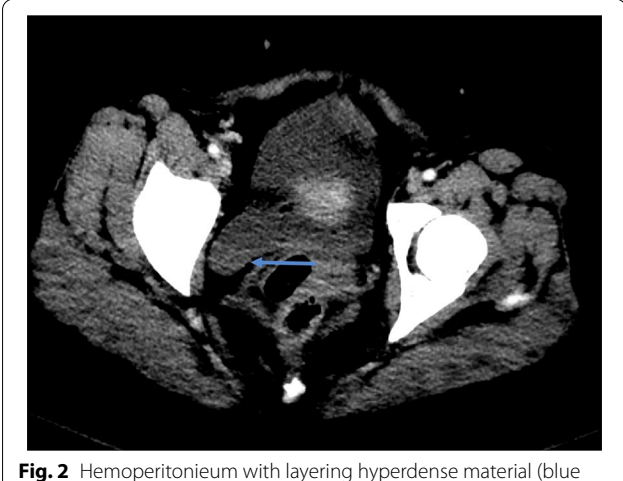
arrow) compatible with blood products

a minute fragment of fibrous tissue with few pigmented macrophages and benign mesothelial cells.