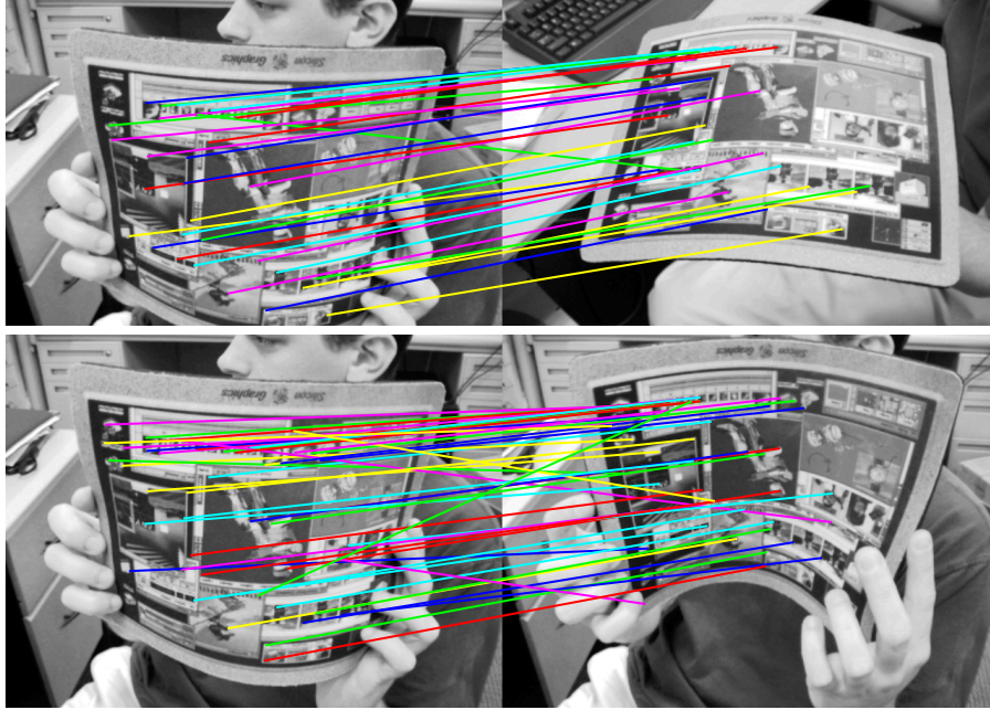
Fig. 1. Affine tracking + KPCA: A non-planar surface undergoing warping and viewpoint changes. (Top-left) The first image of the training sequence. (Top-right) The test image, outside of the training sequence. 27 feature locations were correctly matched, with 2 false positives. (Bottom-left) Image from the training sequence. (Bottom-right) The warped object. 40 locations correctly matched, 6 false positives.