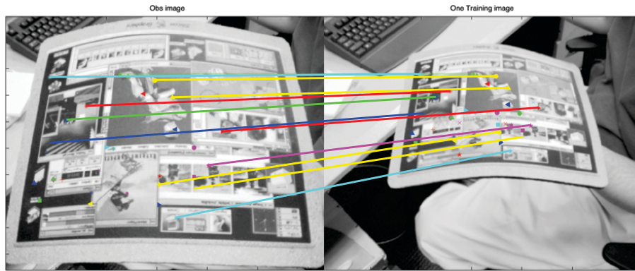
Fig. 3. Translational + KPCA: Matching using a non-planar surface undergoing warping and scale changes. During training, the object was moved away from the camera and deformed. (Left) shows the first image of the training sequence. (Right) shows the test image, which is outside of the training sequence. The shapes and colors indicate the corresponding points. In this example, 50 feature locations were correctly matched, with 10 false positives. Some lines between matches are included for clarity.