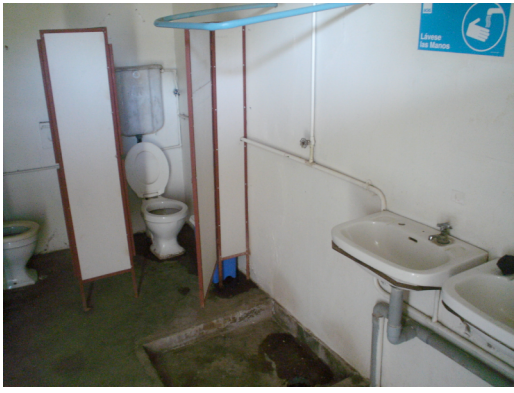
Figure 3 Washing hands with Marina in the bathroom of Echeñique Packing.Figure 4 A view of the toilet section in the women's bathroom of Echeñique Packing.

Hygiene and health is an important area that is also subject to the (in)visibility of material objects and the carrying out of discipline and responsibility. In the women's bathroom pictured above, there were no rolls of toilet paper or paper towels in the bathroom. This was the case for all three packing plants I worked in, except for the third plant which stocked the bathroom with toilet paper prior to the arrival of the Work Inspection. Each worker is responsible for bringing toilet or tissue paper, although legally, it had to be provided by the company. Only when the Work Inspection was scheduled for a visit (they always notify ahead of time, defeating the purpose of seeing the working conditions as they are throughout the season) or a plant certification had to take place, did the soap, fire extinguisher, and toilet paper appear.