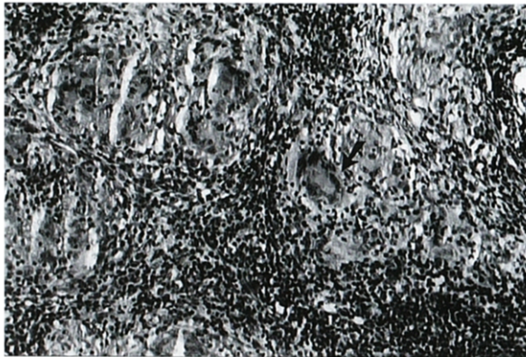
Fig 2 Multiple non-caseating granulomas indicative of an infectious process. A multinucleated giant cell (arrow) is seen in the centre (haematoxylin and eosin, original magnification \times 100 ).

infections (Dalinka et al, 1971). The lesions usually show well defined borders or a well circumscribed, punched-out radiographic appearance, and involvement is often multifocal (Carter, 1934). Periosteal new bone formation accompanied by cortical expansion is sometimes seen (Mazet, 1955).