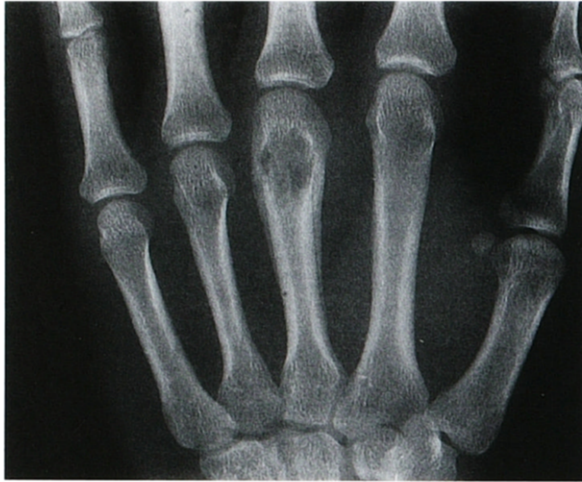
Fig 1 Posteroanterior radiograph of the hand showing a 1.5 cm long lytic lesion at the distal part of the middle finger metacarpal. Benign appearing laminar periosteal new bone surrounds the lesion.