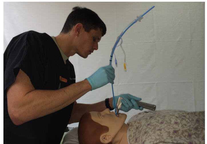
Figure 2. Emergency intubator demonstrating preloaded bougie technique on a mannequin.