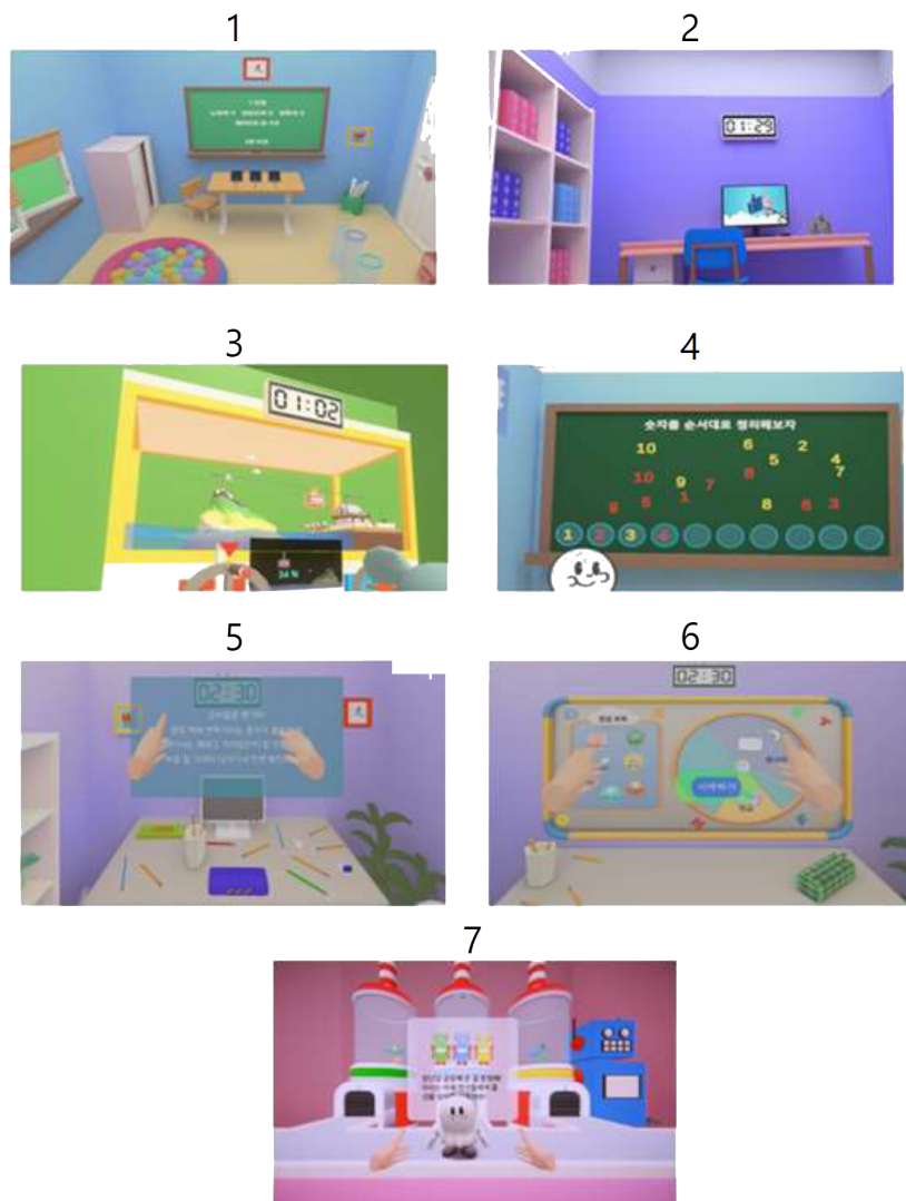
FIGURE 1 Cognitive and behavioral tasks in VR scenarios. 1, moving balls; 2, organizing a room; 3, spinning pedals; 4, matching numbers; 5, packing a backpack; 6, planning schedules; 7, wrapping gifts.

Behavioral data collected from each VR scenarios were calculated into z-scores. Their averages were then matched with