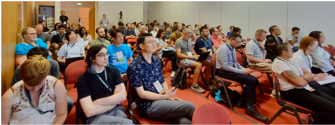
Figure 1. A full room at BOSC 2023 in Lyon, France. BOSC, Bioinformatics Open Source Conference.