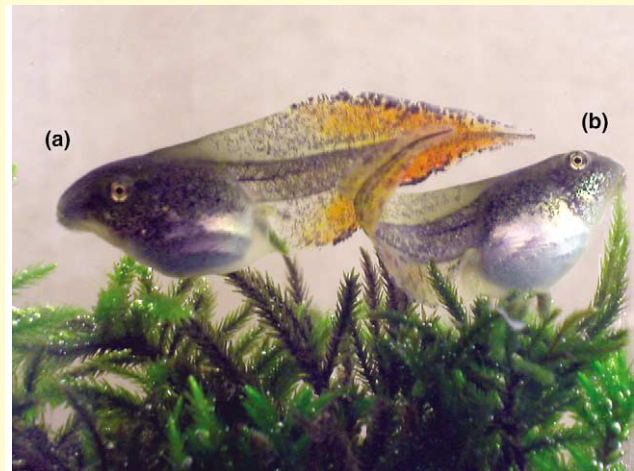
Figure 1. Morphological plasticity in tadpoles. Tadpole (a) has been exposed to predators, resulting in the induction of a colorful and relatively large tail. Tadpole (b) has not been exposed to predators and has a less colorful and relatively small tail.

Because amphibians live in a heterogeneous landscape of predation and competition, plastic traits are favored owing to a tradeoff between predator resistance and growth. This tradeoff affects not only individuals, but also the community via trait-mediated indirect effects [16], and is one example of why amphibians are an excellent model system to use to study the ecology of phenotypic plasticity.