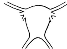
Figure 1 Proposed Toolbox for Surgical Classification for Endometriosis.

a: Revised American Society for Reproductive Medicine scoring system for all women with endometriosis. Reprinted with permission from Elsevier from Fertil Steril 1997; 67 :817–821. American Society for Reproductive Medicine. Revised American Society for Reproductive Medicine classification of endometriosis: 1996. b: Enzian scoring system for women with deep endometriosis. Reprinted with permission from Professor Jörg Keckstein. Reference: www.endometriose-sef.de/dateien/ENZIAN_2013_web.pdf ; accessed 1 February 2016. c: Endometriosis Fertility Index for women with endometriosis for whom future fertility is a consideration. Reprinted with permission from the American Society for Reproductive Medicine. Reference: Adamson GD, Pasta DJ. Endometriosis fertility index: the new, validated endometriosis staging system. Fertil Steril 2010; 94 :1609–1615.