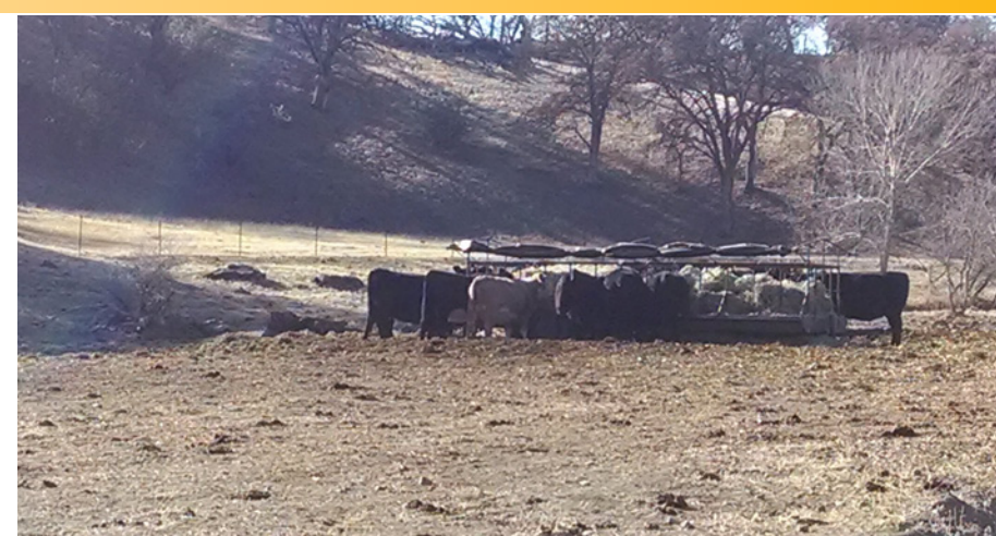
Cattle in a drylot being fed bean straw.

by cattle can inhibit the flow of oxygen to major organs of the body, causing death. Corn stover should be analyzed for nitrates to allow for prudent management of feed for the safety of the cattle. Consult the guidelines in table 3 for interpreting an analysis of feed and water nitrate levels. The units reported in an analysis must match the units in table 3; if they do not, convert them for proper interpretation.