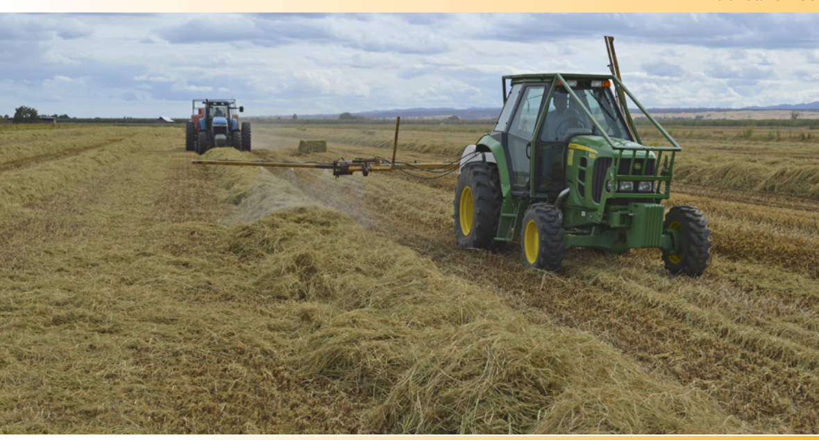
Rice straw can be treated and baled at high moisture to increase intake and prevent mold formation.

During severe droughts or when traditional hay sources are limited or expensive, rice straw and corn stover (baled corn stocks) have been used as low-quality forage. Before purchasing either of these products, a complete feed analysis should be conducted by a certified laboratory. Comparing feed analyses can help you select a product of higher nutrient value that will decrease supplement costs to meet cattle needs.