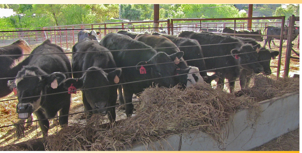
Cattle at a feed bunk eating high-moisture rice straw.