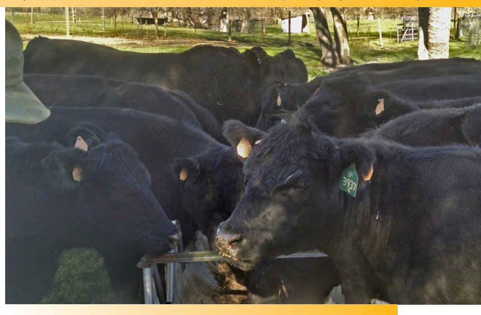
Cattle consuming a concentrate supplement on annual rangeland.

(a) Almond hulls are obtained by drying that portion of the fruit which surrounds the nut. They shall not contain more than 13.0 percent moisture, nor more than 15.0 percent crude fiber, and not