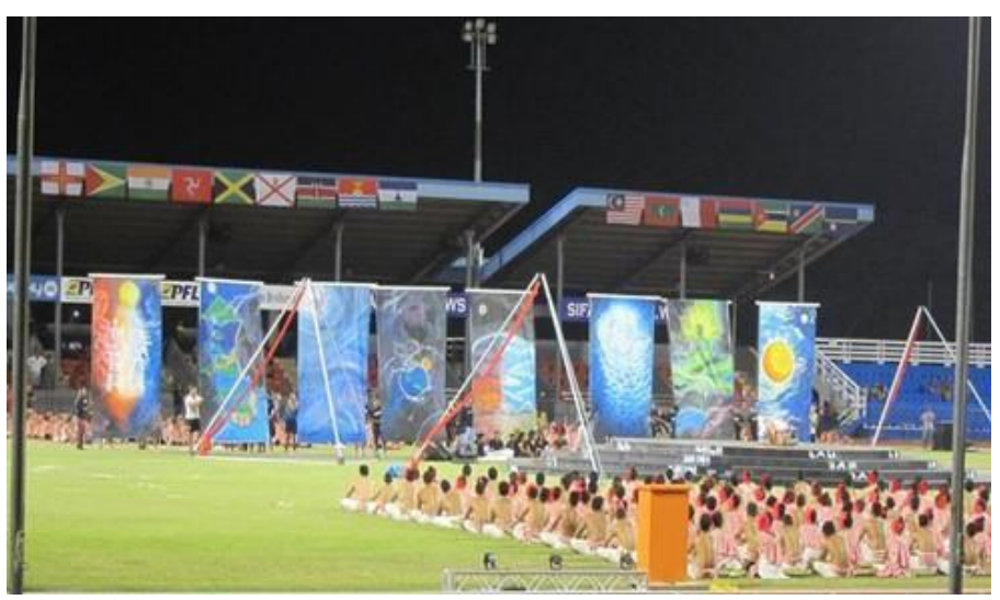
Figure 8. National University of Sāmoa art students, Banners of the Sāmoan Creation Story . Commonwealth Youth Games Opening Ceremony, Sāmoa, 2016.

Australian embassies have provided financial resources in support of student art exhibitions, publications, and students' promotion and marketing their own art work. The revenues from the students' art sales are divided between the students and NUS, which has assisted in funding resources for the visual art courses from time to time.