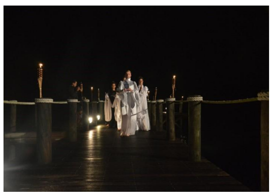
Figure 7. Australian National University students performing the arrival of missionaries to Sāmoa. Sinalei Resort, Sāmoa, 2013.