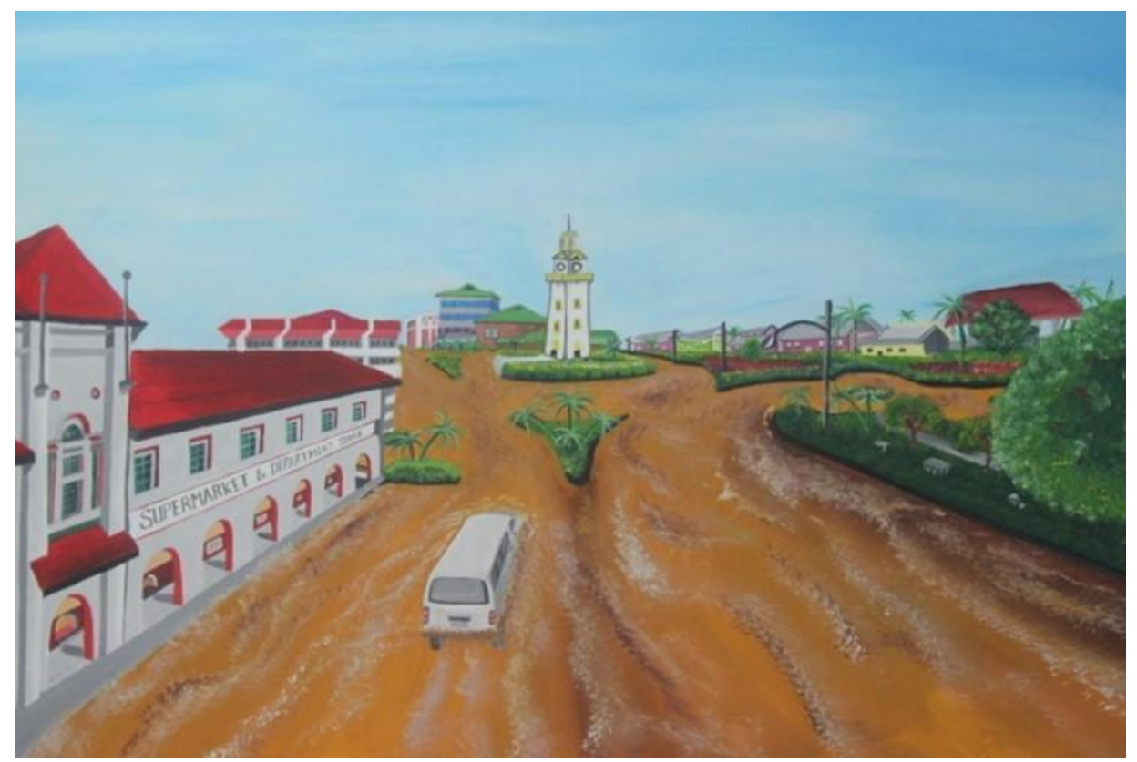
Figure 11. Sofara Sofara, Effects of Climate Change in Apia . Acrylic on canvas, 4" X 6", 2020. National University of Sāmoa.