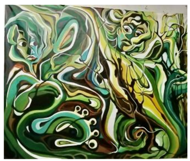
Figure 3. Lealofi Siaopo, Sina and the Tuifiti. Acrylic on canvas, 8" X 6", 2020. Photograph courtesy of the artist

Inspired by Sāmoan mythology and legends taught at the school, Siaopo's painting also emphasises the importance of myths in Sāmoan culture and customs.