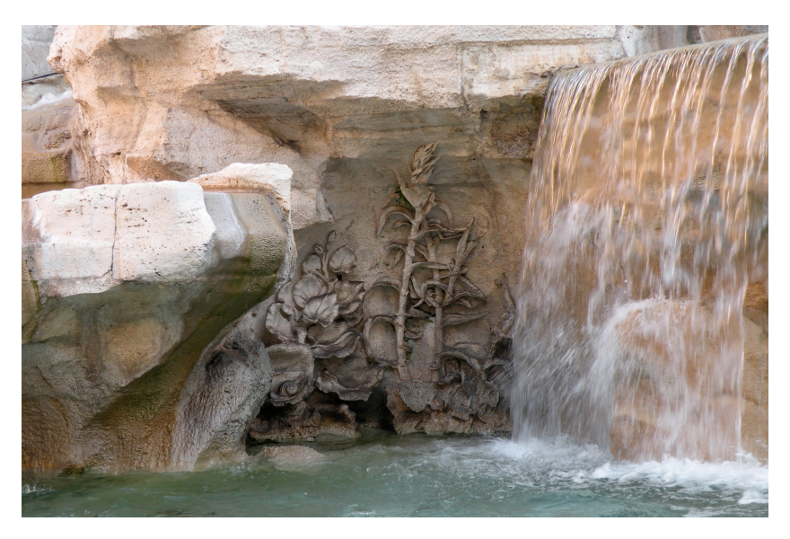
Figure 7: Carved water-loving plants, including Caltha palustris and Arundo donax , emerge from the Trevi basin.

all material things, and winding through the veins of Earth, even into the most minute recesses, reveals itself as the everlasting source of that infinite production which we see in Nature, which water also is capable of perpetuating.