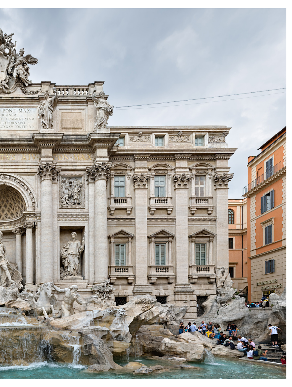
Figure 3: The Trevi Fountain, 2007. Photograph by David Iliff; License: CC-BY-SA 3.0.