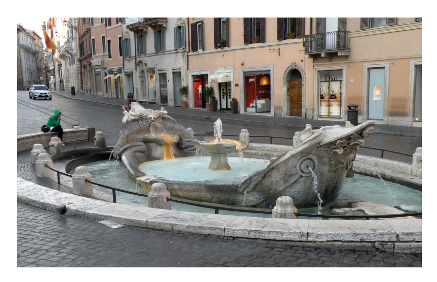
Figure 5: Even at 5:00am on a summer morning, the Barcaccia Fountain provides solace.