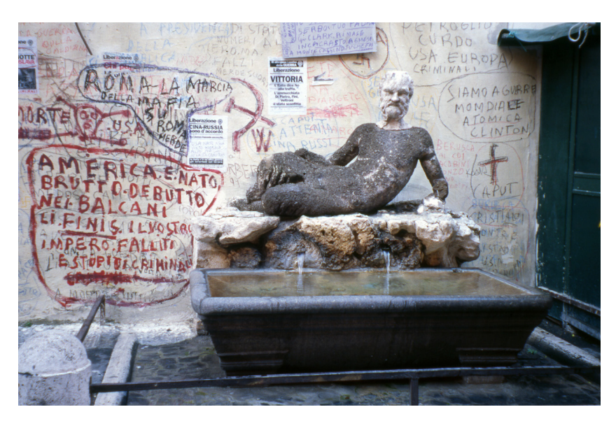
Figure 1: The Babuino, a public drinking fountain from the 1570s where Romans can still post anti-clerical and anti-government pasquinades .

water gushes into piazza fountains with reckless abandon, and bubbles from neighborhood taps in nearly every corner of the city. Little drinking fountains even take root like beneficent barnacles from palace and church walls. No facade is too aloof that it might not, someday, sometime, support its own little nymph or satyr spewing water into a sidewalk basin as an offering to any and all passersby (Figure 1). Rhapsodized by poets, tourists, and artists, the fountains are essential to Rome's identity and are part of the everyday environment of its citizens. What those of us from drought-plagued regions might see as an astounding luxury or extravagance, Romans see as a right of citizenship. Ever present and ever flowing, the fountains symbolize the abundant goodwill and generosity of the Romans themselves: to give water freely, to family, neighbors, and strangers alike, affirms a genuine openness of spirit.