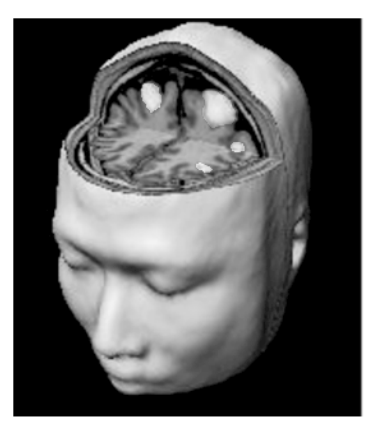
Figure 2: The brighter areas identify implied patterns of neural activation as detected by fMRI.

Being able to imagine how thought processes occur in the brain can help teachers plan lessons and can also help undergraduate students tie together disparate concepts in psychology. The current model lends itself to a activation metaphor so that students can picture thought processes as dynamic intensifying and receding patterns of activation, much as neural activation is depicted by differences in blood oxygenation levels in the brain by functional magnetic resonance imaging (fMRI; see Figure 2).