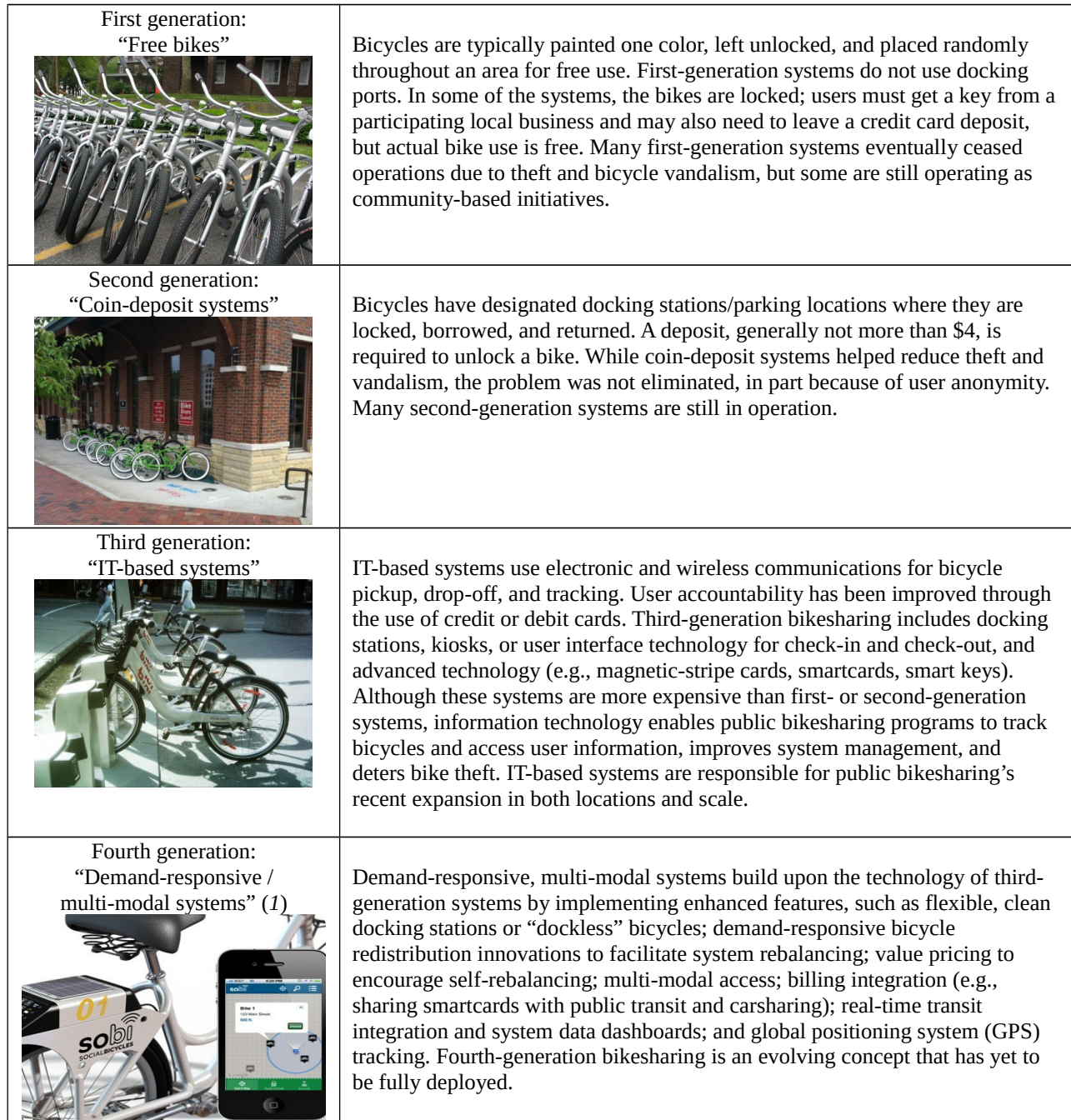
FIGURE 1 Overview of public bikesharing generations.