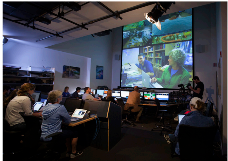
Fig. 1. By allowing scientists in remote locations to engage with a network of experts in real time, telepresence could have a transformative effect on field science. Here, scientists at the University of Rhode Island's Inner Space Center use a telepresence link to discuss deep-sea sampling plans with scientists aboard the Research Vessel Atlantis .

These compelling opportunities come with caveats and challenges, which we explore here through the lens of ocean-based research expeditions. Modern civilization is more dependent upon the oceans' ecosystem