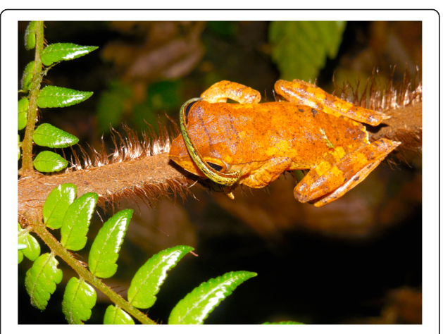
Fig. 1 A terrestrial haematophagous leech ( Haemadipsa spp.) sampling vertebrate biodiversity ( Rhacophorus spp.).

Among the potential sources of iDNA, haematophagous terrestrial leeches (Fig. 1) have received considerable recent interest from the conservation biology sector. Relevant species belong to the family Haemadipsidae, within the suborder Hirudiniformes [20-22], and members of this family occupy large parts of Asia, Australasia, and Madagascar [20, 23] - areas that are known for their extensive tropical rainforests, rich biodiversity and number of endemic or threatened vertebrate species [24-26]. Given that monitoring efforts are often severely hampered by the limited economic support available, one of the most attractive benefits of using leech-derived iDNA as a tool is that collection is cheap, rapid, and requires no special skills or equipment, allowing easy recruitment of personnel from local people. The leech collector simply offers his/herself up for bait. Valuable equipment is not at risk of being damaged or stolen - unlike camera traps - and there is no need for batteries or CO<sub>2</sub> - unlike mosquito traps. Furthermore, in addition to their ease of