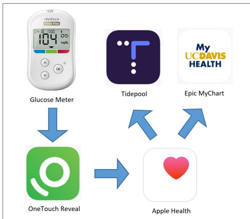
Figure 1. Relay of glucose data via mobile health apps.

After hospital discharge, the principal investigator reviewed glucose data for children in the intervention group daily in both Tidepool (a secure web-based platform for diabetes data management) [8] and Epic (the EHR used at UCD) and called their caregivers to discuss any needed changes in insulin dosing. This continued until each child's first visit at the pediatric diabetes clinic. Children in the control group received usual care between hospitalization and first clinic visit, as described above under "Setting."