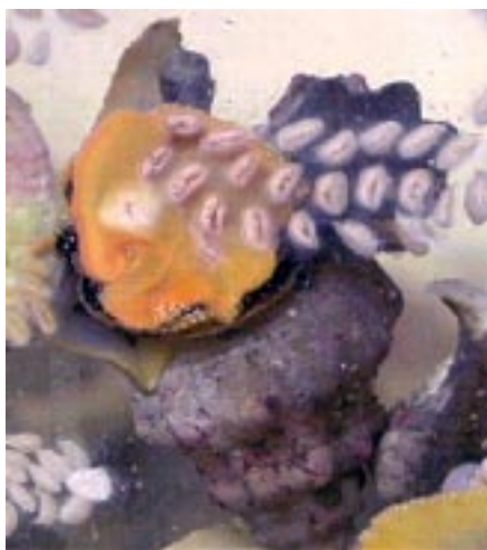
Female snail laying egg capsules.

Many marine snails package (technically speaking, “deposit”) their eggs in special protective wrappings called egg capsules, not too unlike heavy-duty egg cartons. Female snails string these capsules into a variety of weird and wonderful shapes. Some look like candy necklaces, miniature Chinese dragons, waxy blobs, a tiny crushed trumpet, or lima beans on a string. The longest strings reach over a foot in length; most are much shorter.