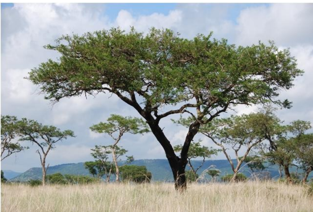
Figure 1. What determines tree–grass ratios in tropical savannas? (Photograph taken at Weenen Game Reserve, South Africa).

However, two studies that were recently published have challenged various aspects of these two hypotheses. February et al. (2013) set up experimental plots to assess the effect of rainfall manipulation on tree growth in a nutrient-poor mesic and a nutrient-rich semi-arid savanna