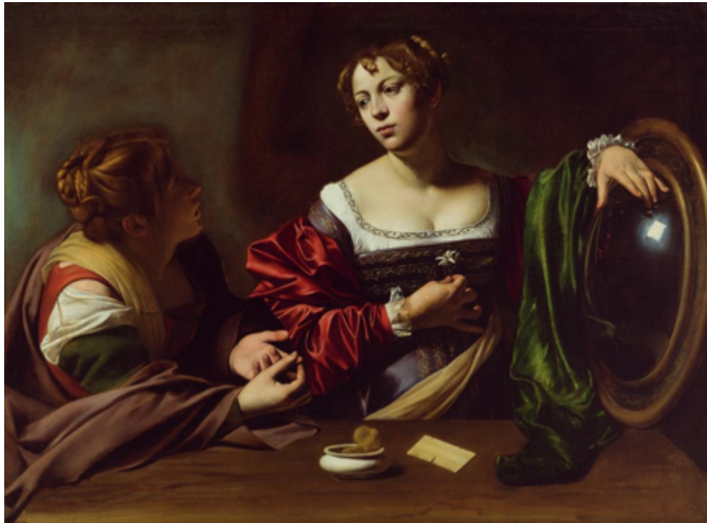
Figure 2 Michelangelo Merisi da Caravaggio, Martha and Mary Magdalene , 1597/8, oil and tempera on canvas, 100 × 134.5 cm. Image courtesy of Detroit Institute of Arts: 73.268.

real Medusa's reflection, which, in Grotto's conceit, is equivalent to the real Medusa herself; by averting his Medusa's eyes, Caravaggio renders it impossible for a viewer to disprove his Gorgon's—or, rather, his Gorgon-reflection's—power to stun. Grotto's introduction of the mirror image that is equivalent to its three-dimensional referent broadened the potential for rendering Medusa's "lifelikeness" in painting: Grotto allowed the two-dimensional image to gain in proximity to the real being it represents. Caravaggio thus had only to depict the Gorgon's reflection to produce an image of her that could be equivalent to the "real thing"—perfectly doable in the two-dimensional medium of painting and easily communicated by painting on a shield (Perseus's reflective medium of choice). That Caravaggio's Medusa depicts a reflection is still further supported by the fact that the painting was likely produced in the manner of a self-portrait, rendered with the use of a convex mirror, as depicted in Caravaggio's Martha and Mary Magdalene (of 1597/98 and thus contemporary to the Medusa ) (Fig. 2). 7