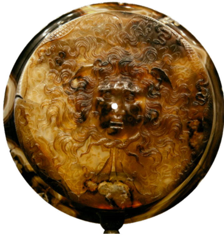
Figure 8 “Tazza Farnese,” sardonyx cameo bowl (exterior), 1st C. BCE, Naples, Museo Archeologico Nazionale.

Ovid’s Metamorphoses offer the earliest account of Perseus beheading Medusa, whose decapitation is enabled by Perseus looking not at Medusa herself but instead at her reflection in a bronze shield supplied by Athena. As per Ovid: