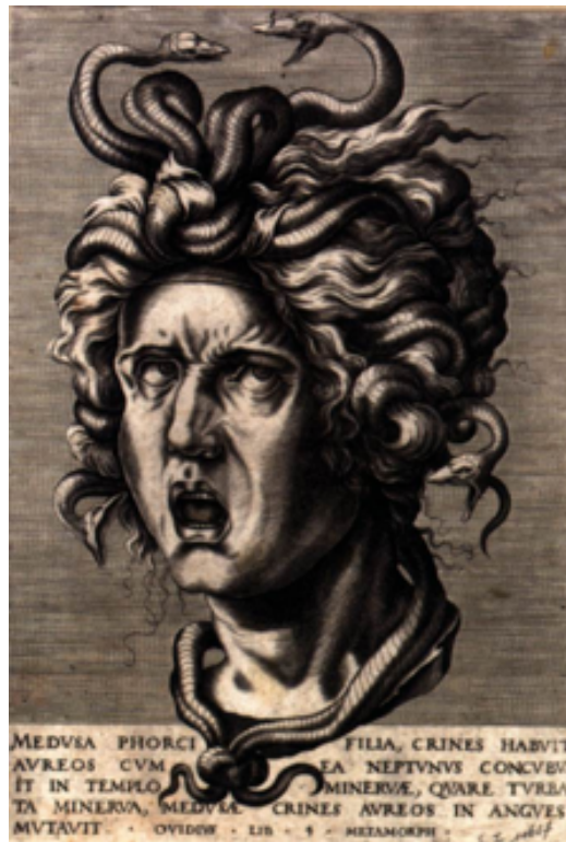
Figure 3 Cornelis Cort (1536–1578), Head of Medusa, engraving, 334 × 226 mm.