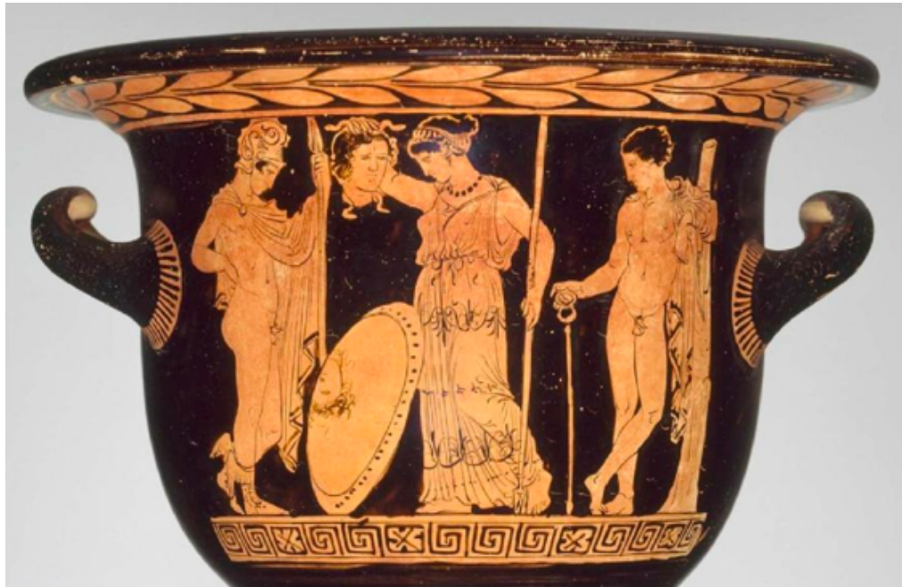
Figure 15 Apulian red-figure bell krater, c. 400–385 BCE, attributed to Tarporley Painter, Boston Museum of Fine Arts: 1970.237.

onward, the image, the reflection, of Medusa was newly conceived of as an image that—in Van Eck’s words—possessed the same agency as the living being it represented, and noting that this deliberate shift from the powerless image to the powerful image was produced in the context of praising artistic skill measured by lifelikeness, we can interpret the averted eyes of Caravaggio’s Medusa as follows: in maintaining the fiction of the image, that the Medusa depicted can stun, images of Medusa that deny the viewer eye contact maintain the fiction that their artist is so technically gifted as to have been able to produce an image equivalent to the living being it represents (with, in Caravaggio’s case, the mediating function of the mirror, the image found within which is allowed by Grotto to be equivalent to the being it represents). As stated above: the Medusa with whom you cannot make eye contact is the Medusa whose powers you cannot disprove, which, in turn, situates the artist as one whose virtuosic technical skill you cannot disprove.