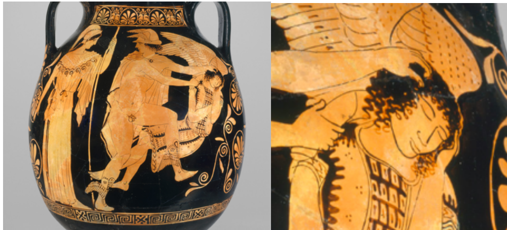
Figure 14 Red-figure pelike, c. 450–440 BCE, attributed to Polygnotos, New York, Metropolitan Museum: 45.11.1.

by viewing not her but her reflection in his bronze shield; Medusa becomes an image, and Perseus proceeds to take possession of her agential powers of gazing. This, Mack says, is the impetus behind the “failed” maintenance of the “fiction of the image” in frontal images of Medusa: the viewer is cast as Perseus.