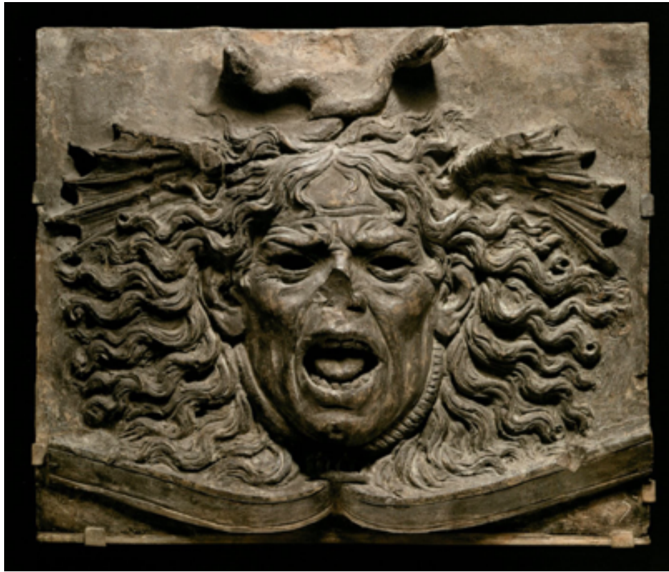
Figure 5 Andrea del Verrocchio (attributed to), Medusa head, c. 1480, from terracotta relief, Palazzo at Via dell'Arco de' Ginnasi, Rome (now destroyed).