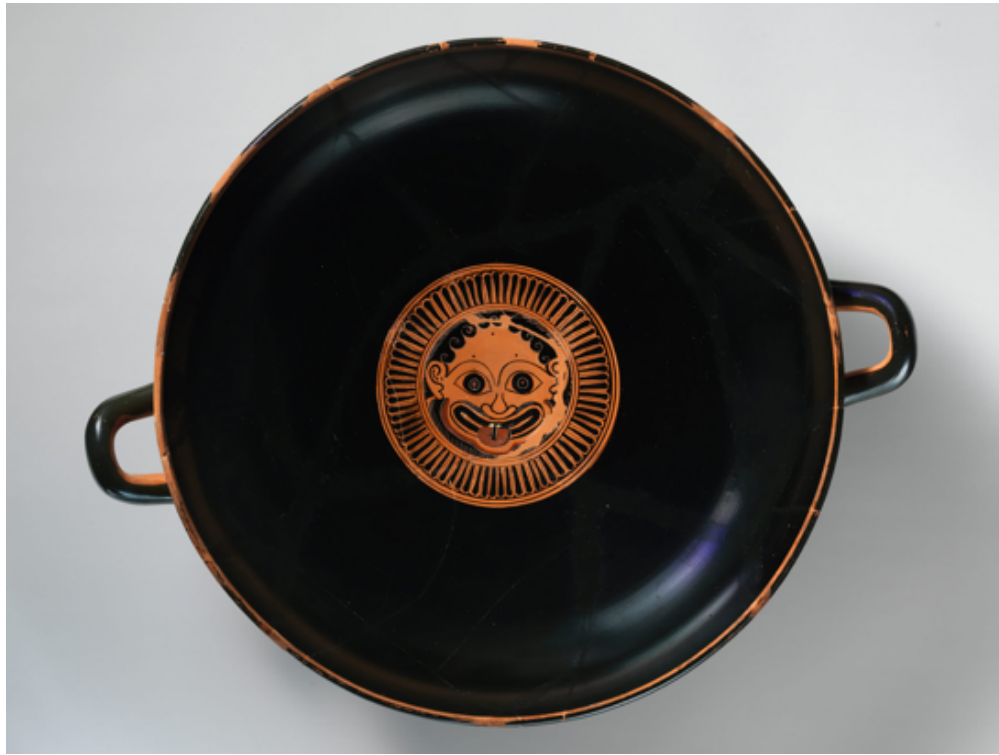
Figure 12 Red-figure eye-cup, c. 580 BCE; New York, Metropolitan Museum: 14.136.

that “Marino’s undeniable thematization of his own virtuosity . . . lends support to the view, often expressed but never fully explicated, that Caravaggio also made the expression of the power of his own art into a conscious theme of his painting.” 41 My suggestion is that Caravaggio depicts his Medusa ’s eyes averted—in contrast to nearly all the visual comparanda he might have encountered at the time—expressly to “thematize his own virtuosity” by maintaining the fiction that his painted Medusa possesses the same power to petrify as does the real Medusa. I suggest this in relation to Rainer Mack’s theorization of how the ancient, frontal Medusa functioned, a model that Caravaggio seems to have deliberately avoided.