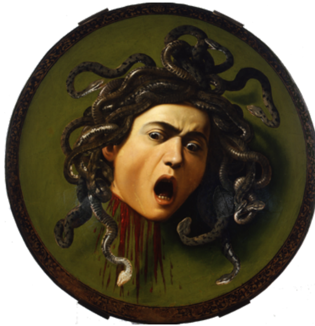
Figure 1 Michelangelo Merisi da Caravaggio, Medusa , 1598, oil on wood, 60 x 55 cm.

Ovid's tale of Perseus and Medusa, in the first-century CE Metamorphoses , Medusa's reflection cannot stun its viewer. In Luigi Groto's 1587 poem "Scoltura di Medusa," 4 however—the poem thought to be the first in the Renaissance to revive the conceit of Medusa as a sculptor 5 —Medusa's reflection can stun the viewer, expressed through the fact that Groto's Medusa is figured as a sculptor of her own image: she catches sight of her reflection in a mirror and thus petrifies herself.