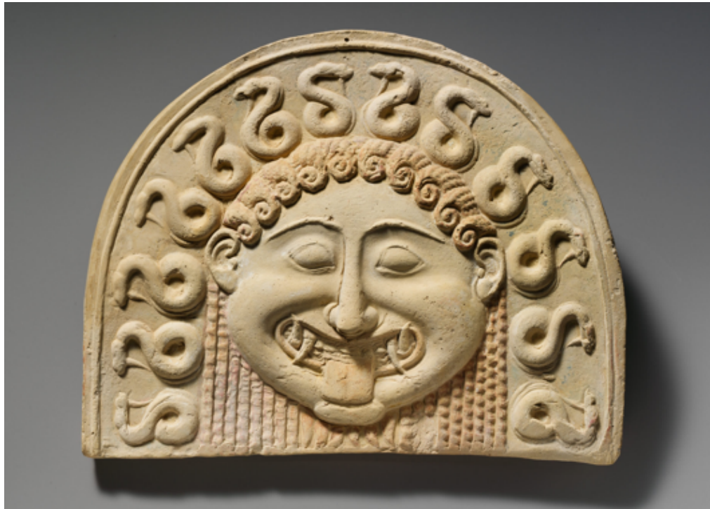
Figure 13 Terracotta painted gorgoneion antefix (roof tile), archaic, c. 540 BCE, Greek or South Italian or Tarentine; New York: Metropolitan Museum: 39.11.9.

this makes sense, of course, in the context of Athena’s aegis or a shield device. The breadth of appropriate contexts for the glaring Gorgoneion, however—not just battlefield, but drinking party, too—suggests that its intended effects transcend the inspiration of fear and intimidation (indeed, some have even suggested comic connotations).