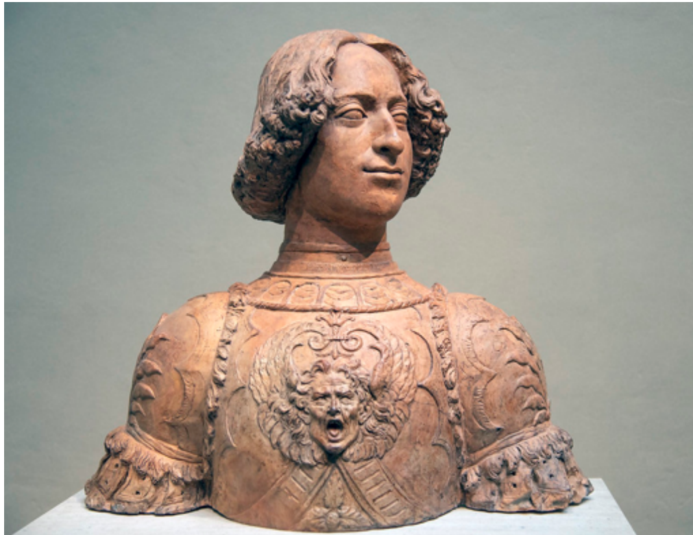
Figure 6 Andrea del Verrocchio, Giuliano de' Medici, c. 1475/1478, terracotta.