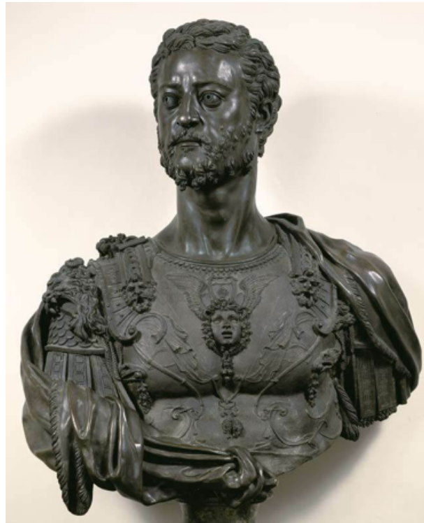
Figure 9 Benvenuto Cellini, Bust of Cosimo I, 1546-47, bronze.

As Caroline van Eck writes, the landscape leading to the Gorgons' home "is described as a statue garden, full of the petrified victims of [the Gorgons'] gaze." The metaphor of the statue garden—and, thus, of the Gorgons as sculptors—is based not solely on this one passage, and on the fact of Ovid envisioning the Gorgons' "grounds" in a way that might coincidentally recall a sculpture garden. Rather, in the later episode wherein Perseus battles Phineus, Ovid describes the victims of petrification (effected by Medusa's disembodied head, now wielded by Perseus) in words undeniably evocative of statuary. Van Eck highlights: "Thescelus became a statue, poised for a javelin throw"; "there he stood; a flinty man, unmoving, a monument in marble"; "Astyages, in wonder, was a wondering marble." 25 Referring to Ovid's Medusa as "Pygmalion's dark double," Van Eck states that, of the stories in the Metamorphoses , "two among them explore the precarious borders between a lifeless image and the living being it represents, the viewer's desire that an image lives, and fear of its powers: those of Pygmalion and Medusa." 26 The aforementioned Astyages is "in wonder" because he mistakenly brought his sword down on a marble man, "mistaking rock for flesh, for living flesh." 27 If the metric of technical skill in image making is lifelikeness, and it