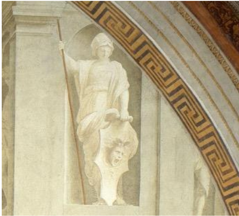
Figure 11 Raphael, The School of Athens , detail, 1509–11, Apostolic Palace, Vatican City .

The italics are my own, highlighting what are here unidentified as early modern interpretations of the Medusean myth. The second italicized sentence holds true in the case of Ovid’s Pygmalion, but it is less convincingly present in the context of Ovid’s narrative of Perseus and Medusa. At no point do Medusa’s petrified victims (re)gain life in the way Pygmalion’s Galatea does; while Pygmalion’s narrative explicitly attests to the presence of life in a sculpture, Medusa’s narrative only suggests it—what was once alive certainly still bears the formal trace of its erstwhile animacy (recall Astyages’s misguided blow), but there is no movement, voice, or reversion to flesh to unambiguously affirm the lingering presence of life. More important, an episode of “petrification resulting from a confrontation with that mirror image” is not only absent from the Metamorphoses but radically opposed to the events that do occur: