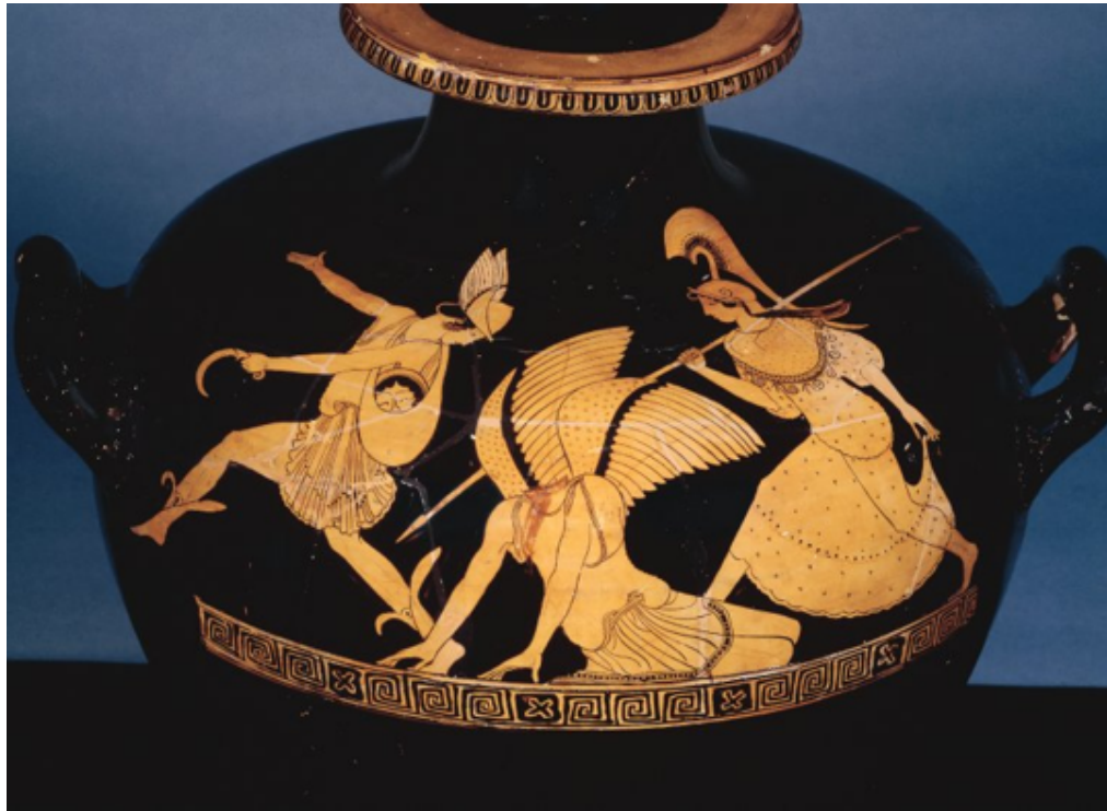
Figure 16 Red-figure hydria, c. 460 BCE, attributed to Pan Painter, London, British Museum: 1873,0820.352.

precarious relation, in which inanimate images turn out to possess the same agency as the living being they represent.” 48 Cropper subsequently suggests that “Marino’s epitaph for Caravaggio” also “expresses this shocking power. Death and Nature, he writes, conspired to kill Caravaggio, the one because he brought the dead alive with his brushes, the other because she was conquered in every image that Caravaggio created rather than painted (“da te creata, e non dipinta”). Caravaggio’s figures, even in action, are creations, not imitations; they are statues, models, simulacra.” 49 Cropper’s interpretation of Caravaggio’s intentions is fundamentally equivalent to my own, but the painting’s formal qualities on which she establishes her reading differ. I would suggest that this is because Cropper assumes the accuracy of Louis Marin’s reading of the Medusa —she terms it “brilliant” 50 —which, I believe, is limited precisely in that Marin is not aware of the divergence between Ovid’s conception of the Medusean image and the later Grotto/Marino understanding (i.e., the powerless image vs. the powerful image).