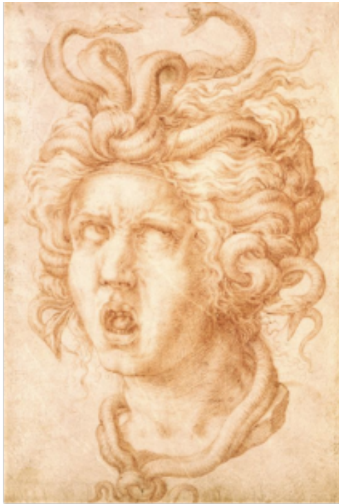
Figure 4 Francesco Salviati, Medusa , c. 1540, red chalk on off-white laid paper. Image courtesy of Indianapolis Museum of Art: 47.13.