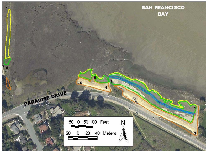
Figure 2. Aerial map of Triangle Marsh.

Caltrans provided funding and assistance to the Marin Audubon Society (MAS) with monitoring work for the restoration of 0.48 ha (1.19 a) of tidal marsh habitat (figure 2). The restoration occurred within three areas of the site: the eastern and middle portions of the site along Paradise Drive and the levee along the western property boundary. Upland areas were excavated to tidal-marsh elevation while existing tidal marsh and transitional high marsh atop manmade land (fill) were left undisturbed. An upland berm was constructed along the boundary between the marsh and Paradise Drive to provide a physical barrier between the public and the middle site. In the larger, eastern restoration area, this berm has more gradual slopes on its northern (restored marsh) side to provide wetland-upland transitional refuge habitat. The existing western berm was lowered to provide additional transitional refuge habitat. An estimated 8,158 cubic meters (m 3 ) (10,670 cubic yards (cy) of soil was excavated, 1,869 m 3 (2,445 cy) were used on site for berm construction, and 6,289 m 3 (8,225 cy) were removed for off-site disposal.