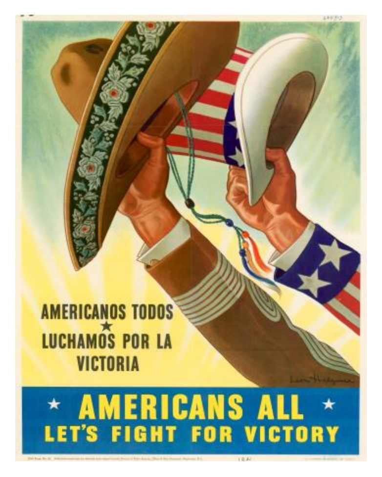
Figure 3.1 1943 poster, "Americans all, let's fight for victory"/ "Americanos todos, luchamos por la victoria"; artist Leon Helguera (Courtesy of University of North Texas Libraries, Digital Library, digital.library.unt.edu; UNT Libraries Government Documents Department).

Mexican government to expel it from the Bracero Program shortly after the program began in 1942.<sup>7</sup>