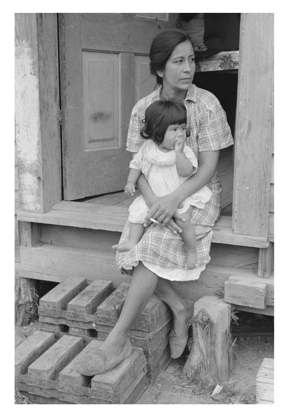
Figure 2.2 Russell Lee, Mexican woman and child in doorway, San Antonio, Texas , 1939 (Courtesy of the Library of Congress).

The Immigration Bureau's DC and El Paso offices mediated on behalf of Mexican nationals whose immigration status was unauthorized and who were under deportation orders. Bureau representatives appeared before the Department of Labor's Special Appeals Board in DC on behalf of clients who appealed their deportation. During the 1930s, the bureau handled close to 200 cases annually. By handling these cases, the NCWC's Immigration Bureau acted as a direct intermediary between the US federal government and non-citizen residents. The process