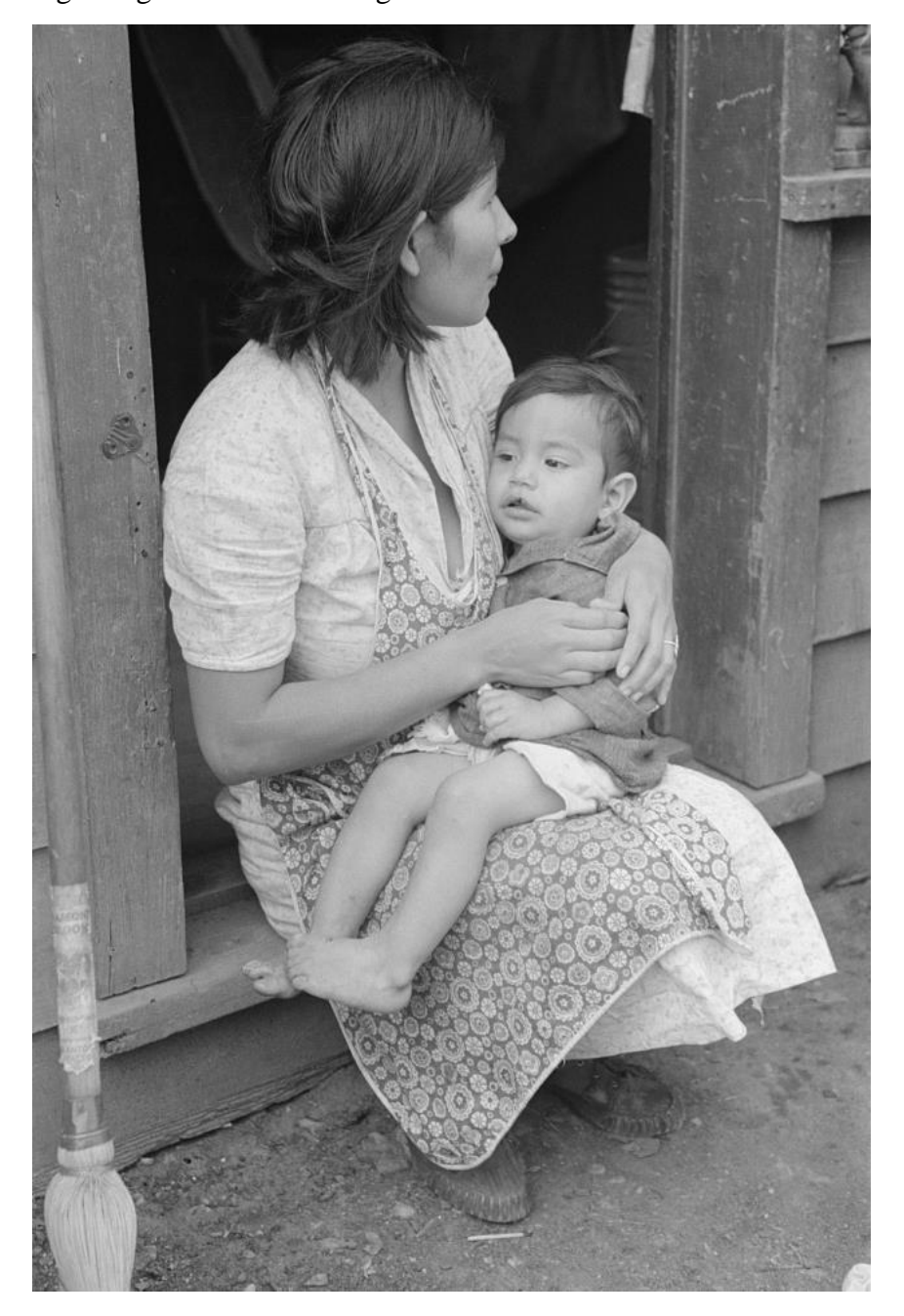
Figure 2.1 Russell Lee, Mexican woman and child, San Antonio, Texas , 1939 (Courtesy of the Library of Congress).

relief. <sup>38</sup> Regardless, the NCWC's Immigration Bureau continued to respond to requests from applicants seeking to regularize their immigration status.