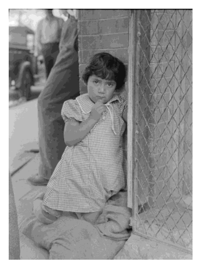
Figure 2.3 Russell Lee, Young Mexican girl who was playing around relief line in San Antonio, Texas , 1939.