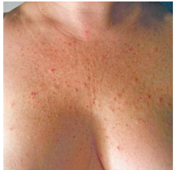
Figure 1. Multiple erythematous papules on chest

Histopathology: There is a circumscribed proliferation of blood vessels within the reticular dermis. The vessel walls are slightly thickened and are lined by plump endothelial cells. There is an accompanying infiltrate of lymphocytes, eosinophils, and mast cells.