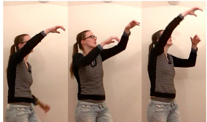
Figure 2: An ambiguous action: ‘climb’ or ‘build’.

We created short movie clips showing an actor gesturing simple events. The verbs were gestured in such a way that the events acted out could be interpreted either as a motion event or as an intensional event.