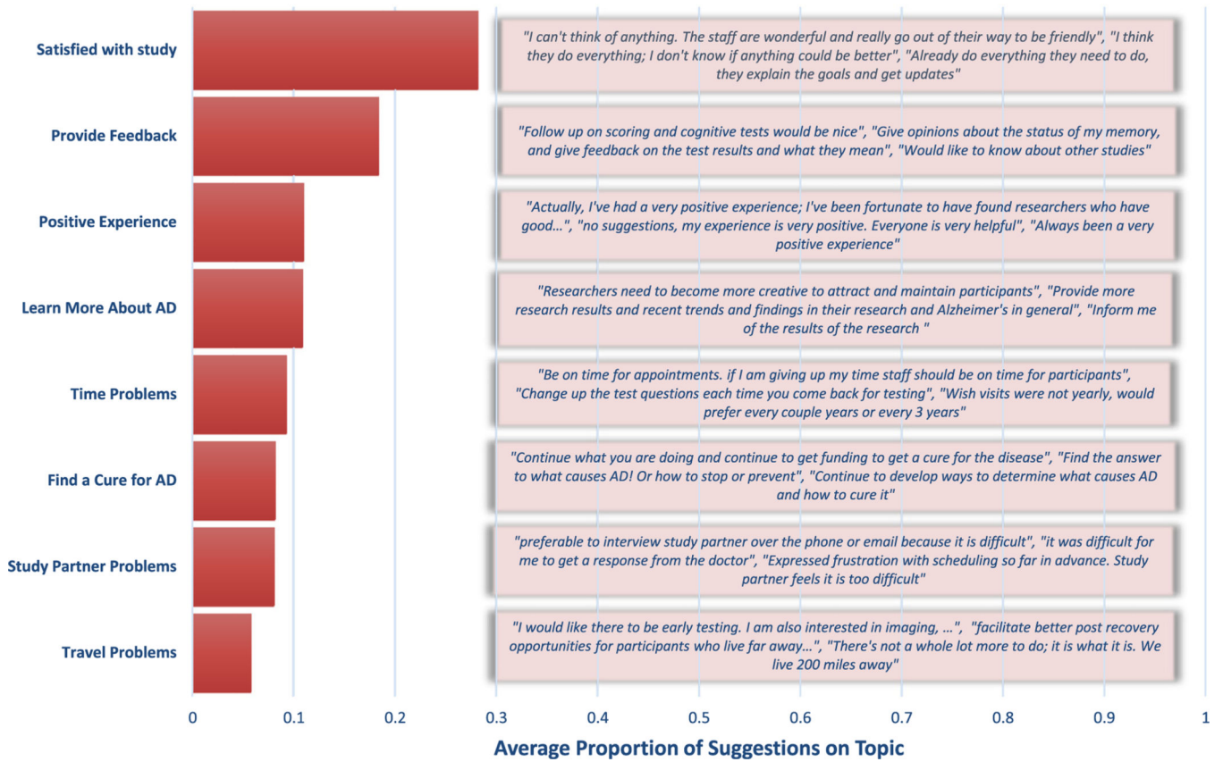
Fig. 3. Topic model of participants' suggestions to enhance their study experience. The text presented for each topic represents the beginning of the three comments with the highest share of the specific topic.