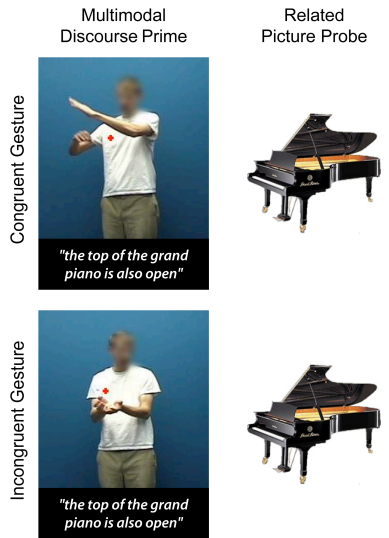
Figure 1. Primary Picture Relatedness Task